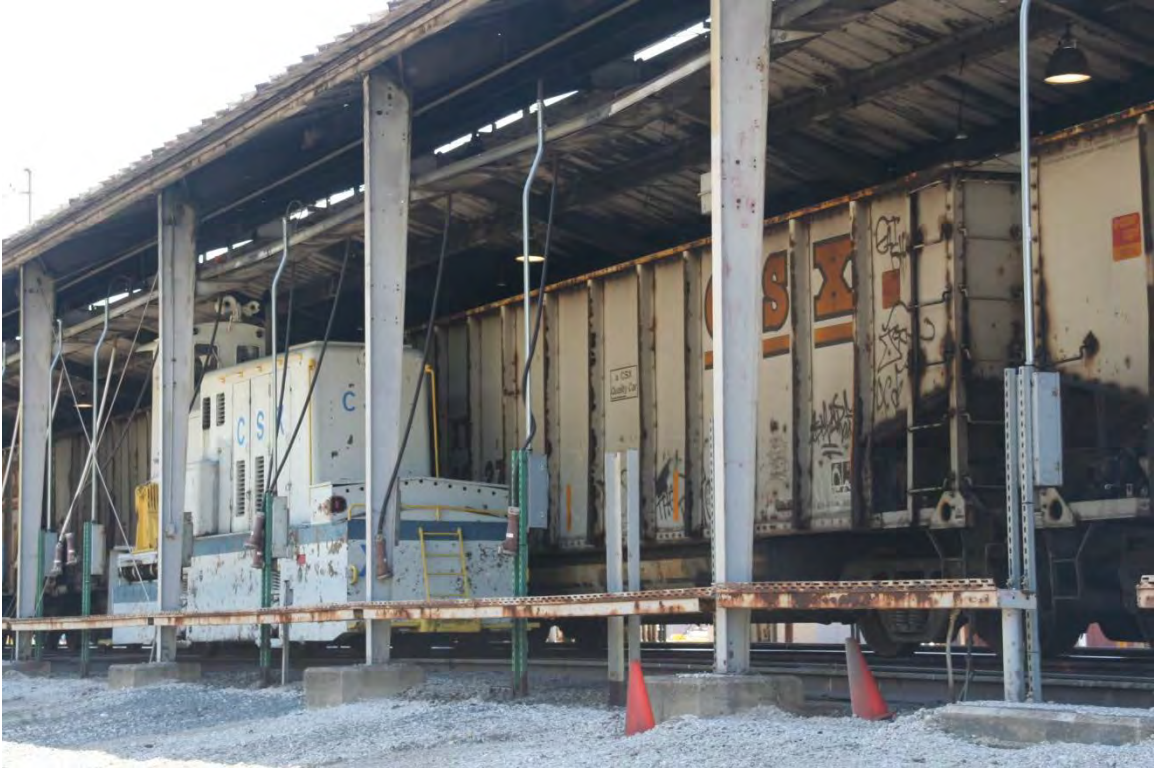
Above, The Pig Hole and below, Four Buck Yard.