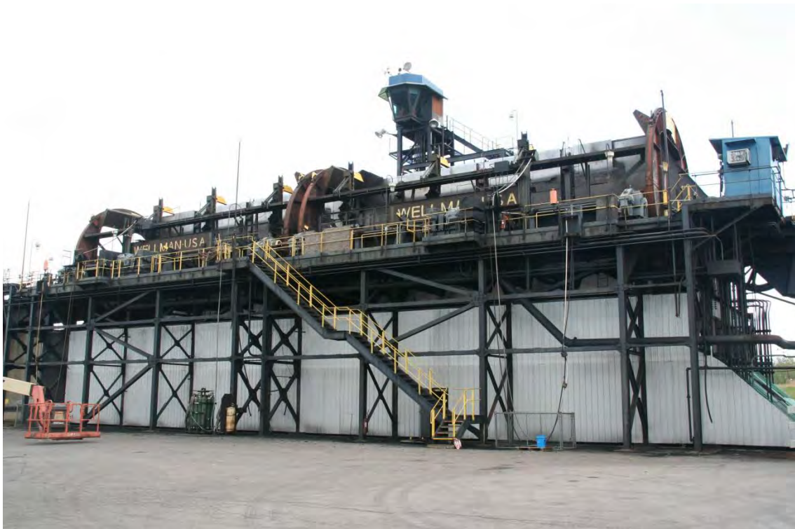
Above and below are two views of “No. 4 Barrel” that dumps the coal from the loaded coal cars onto the conveyor belt to feed the flood loader.