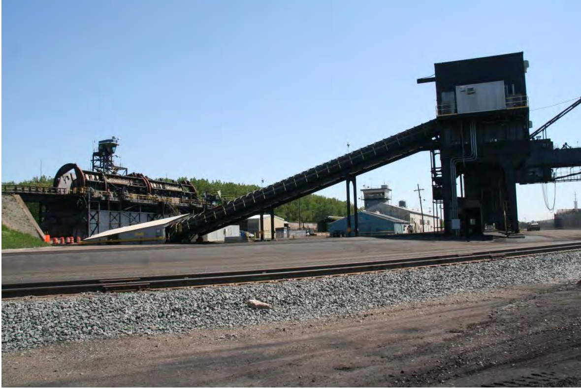
Above and below are views of the front of the rotary dump.