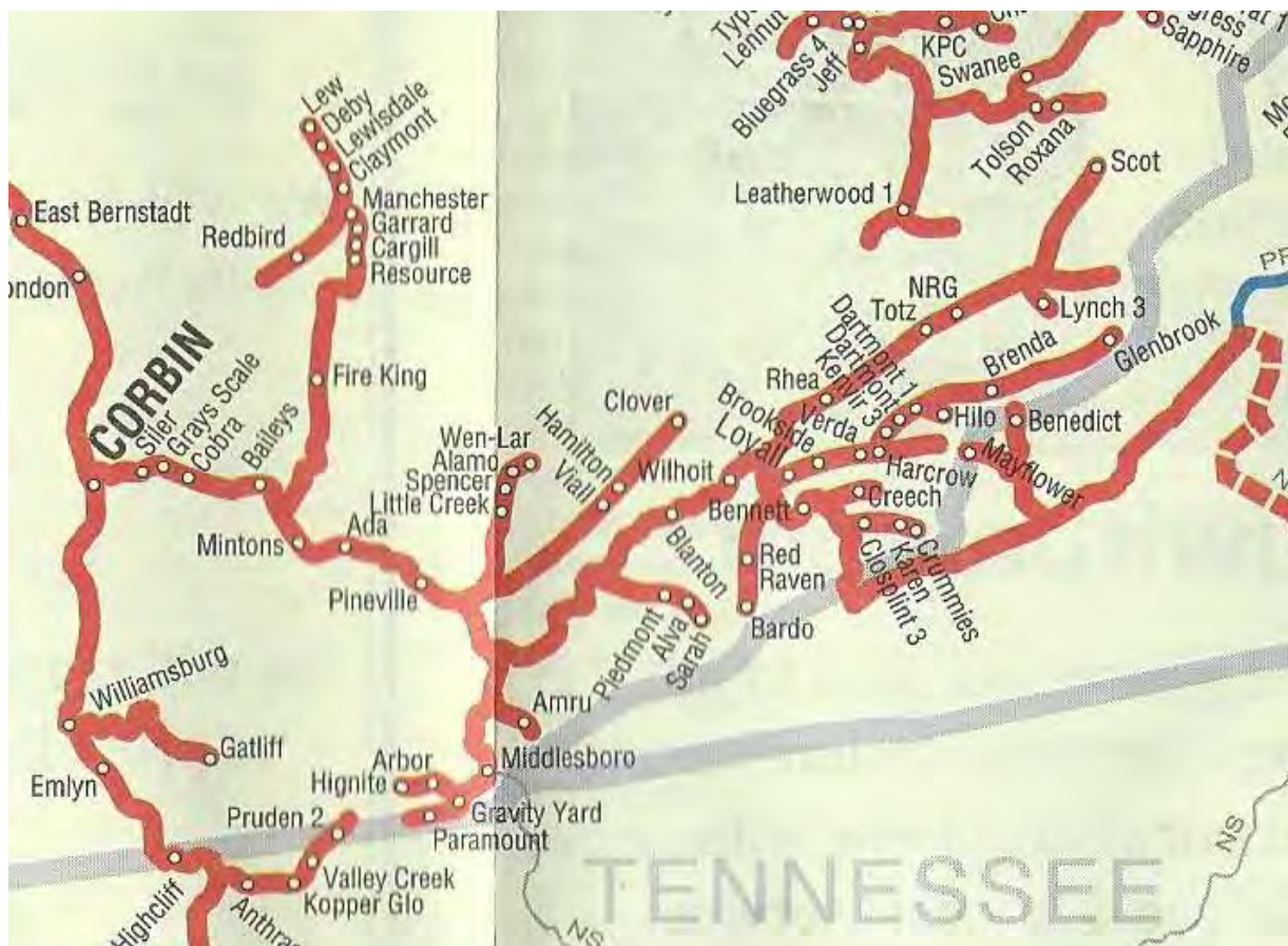
CSXT CV SUBDIVISION

To my surprise, I did pass a CSXT Loyall-bound empty coal train at Dryden, VA as I came back home. It was the first CSX train I've seen in over a week. As for Norfolk Southern operations in the coal fields of West Virginia and Virginia, it is almost as bad.