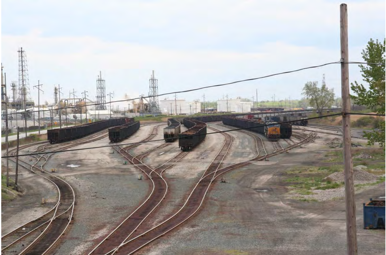
Above and below are views into CSXT's Toledo Docks main holding yard. The tracks to the left serve the ore dock while the tracks right center serve the coal dock.