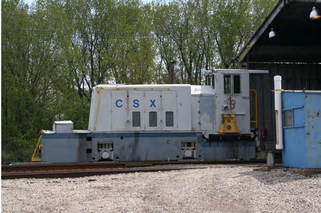
Above and below are views of two of the GE 55-tonners used to move the coal cars to the rotary dumper.