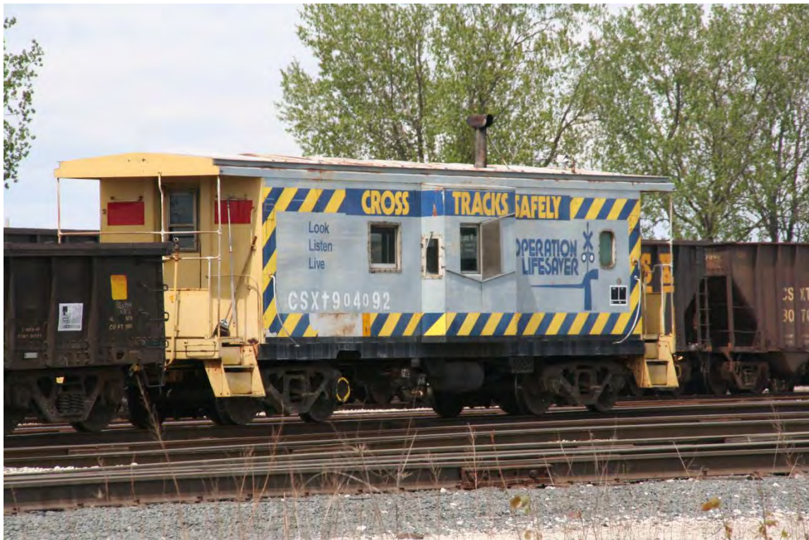
The Toledo Dock's shoving platform.