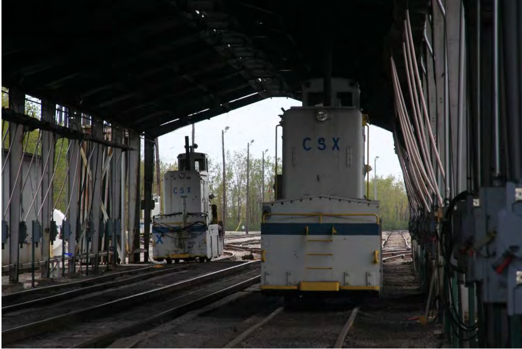
Above and below are views of the 55-tonner pushers at The Pig Hole. Work is done for the day.