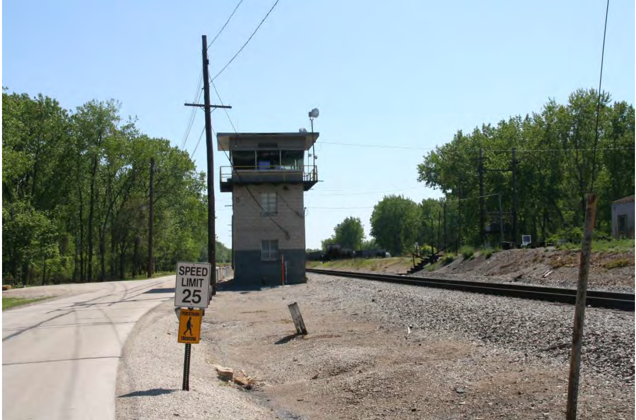
This cabin directs the free running empty coal cars into the correct holding track.