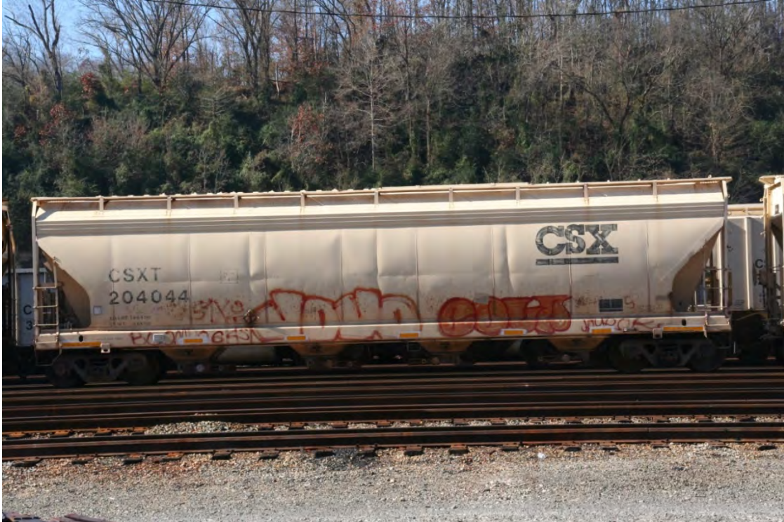
CSXT 204044 is a four bay steel synthetic lined covered hopper. She is 58 feet 5 inches long, 10 feet 8 inches wide, and 15 feet 6 inches high. She can carry 5,250 cubic feet of product with a weight limit of 263,000 pounds. She is at the Paintsville Kentucky Yard in 2012.