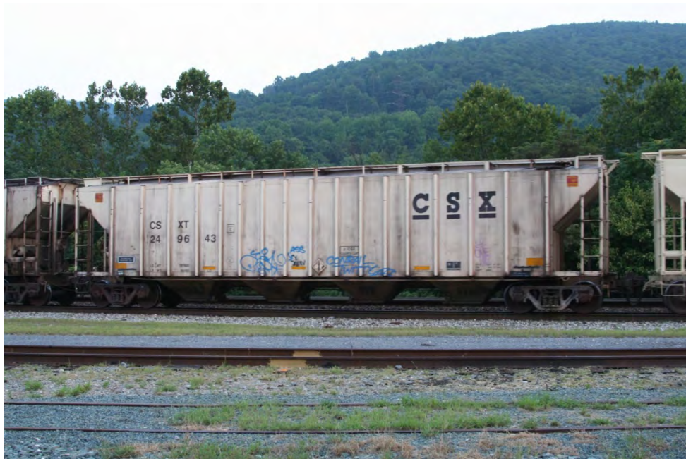
CSXT 249643 is a through hatch four bay covered hopper in grain service. She is 59 feet 3 inches long, 10 feet 7 inches wide, and 14 feet 7 inches tall. She can carry 263,000 pounds of corn or other grains.