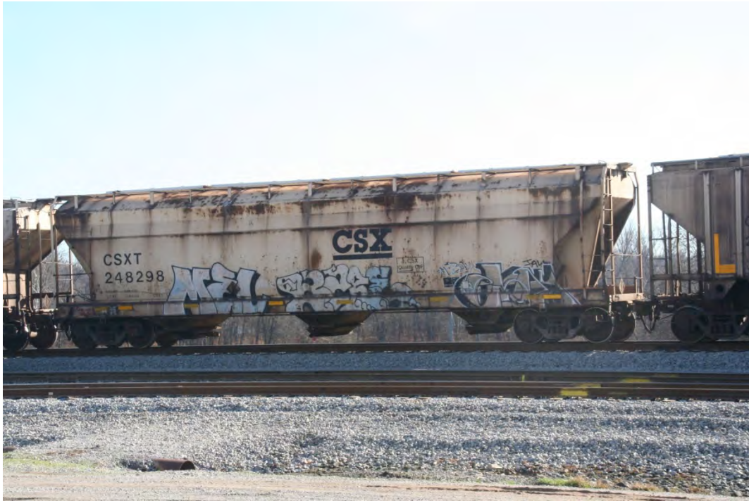
CSXT 248298 shows not only weathering but various graffiti tags. She is seen south of Louisville, Kentucky, in 2012. She is 57 feet 4 inches long, 10 feet 6 inches wide, and 15 feet 1 inch tall. She can load 263,000 pounds of grain.