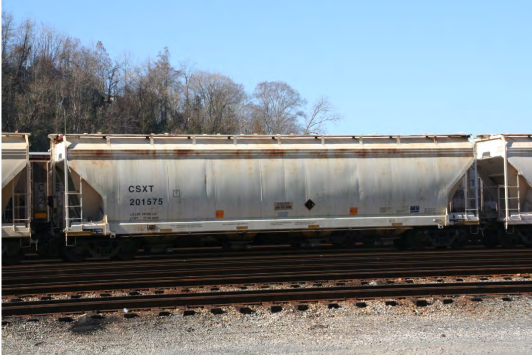
CSXT 201575 is a four bay steel covered hopper with synthetic lining. She is 57 feet 10 inches long, 10 feet 8 inches wide, and 15 feet 6 inches high. Her interior volume is 5,250 cubic feet, and she has a weight limit of 263,000 pounds. She is seen at Madisonville, Kentucky, in 2012.