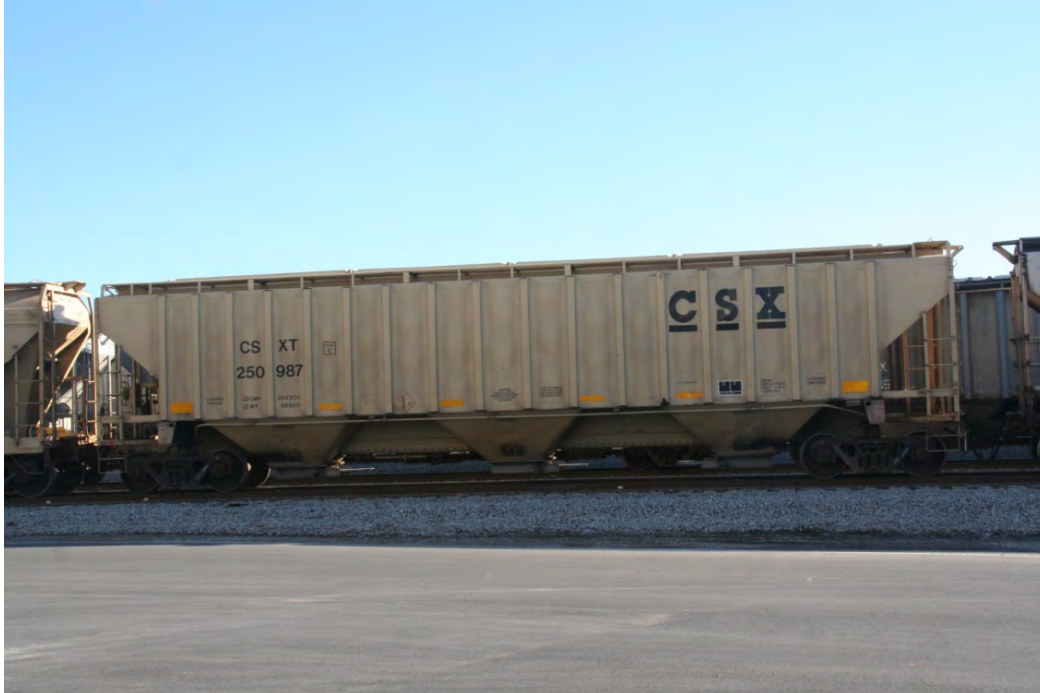
CSXT 250987 is an outside braced three bay covered hopper with a through roof hatch for use in grain service. She is seen in 2012 at the Consolidated Grain & Barge facility at Jeffersonville, Indiana. She is 59 feet 11 inches long, 10 feet 7 inches wide, and 15 feet tall. Her internal load capacity is 4750 cubic feet with a load limit of 263,000 pounds.