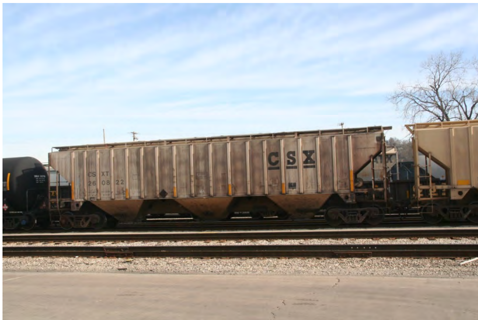
CSXT 260822 is a three bay, outside braced, gravity loading and unloading hopper used in grain service. She is 60 feet long, 10 feet 8 inches wide, and 15 feet tall. She can carry 201,400 pounds of goods within her interior of 4,750 cubic feet. She is seen at the Russell Kentucky Yard in 2013.