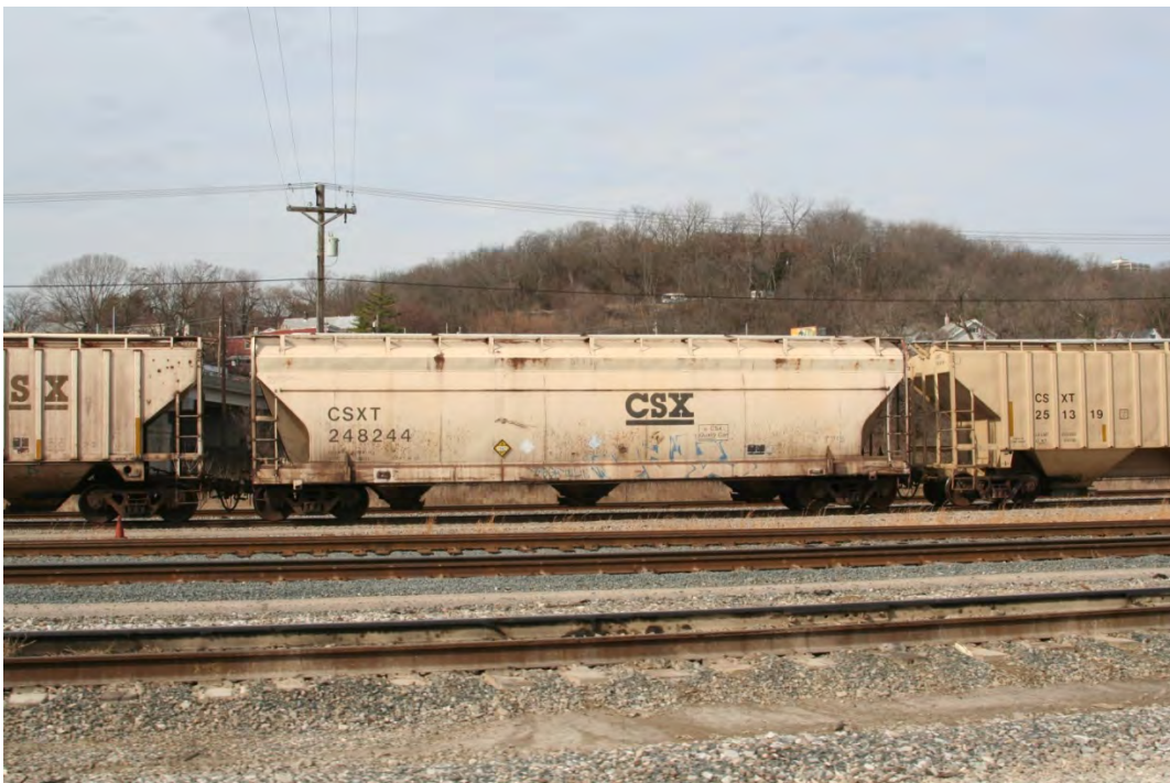
CSXT 248244 is one 231 sister three bay hopper cars in grain service. She is seen at Shelby Yard at Shelbiana, Kentucky, in 2012. She is 58 feet 1 inch long, 10 feet 8 inch wide, and 15 feet 1 inch tall. She can carry 263,000 pounds of grain.