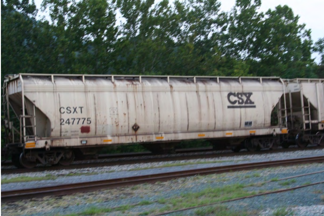
CSXT 247775 is seen at Bowling Green, Kentucky. She is one of 119 sister three bay cars that are 58 feet 1 inch long, 10 feet 8 inches wide, and 15 feet 1 inch tall. With an internal capacity of 4,600 cubic feet, she can carry 263,000 pounds of product.