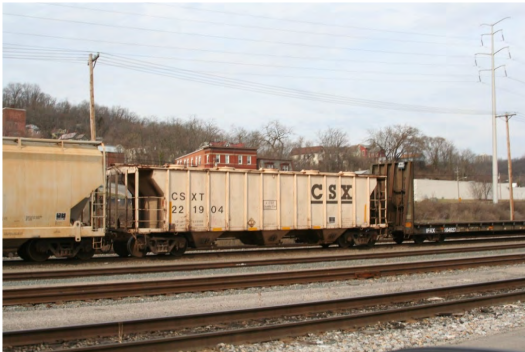
CSXT 221904 is a three bay steel covered hopper. Seen at Queensgate Yard, she is 50 feet 9 inches long, 10 feet 8 inches wide, and 12 feet 7 inches high. Internal loading is 263,000 pounds within her 2,929 cubic feet holding capacity.