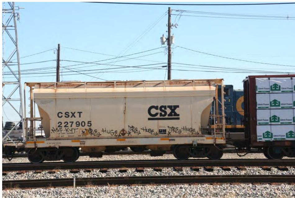
CSXT 227905 is seen at the Madisonville Kentucky Yard. She is a two bay four loading hatch covered hopper with a walkway on top to allow access to her loading hatches. She is 41 feet 111 inches long, 10 feet 8 inches wide, 15 feet 1 inch high. Internally she can carry 263,000 pounds of product within her 2,700 cubic feet interior.