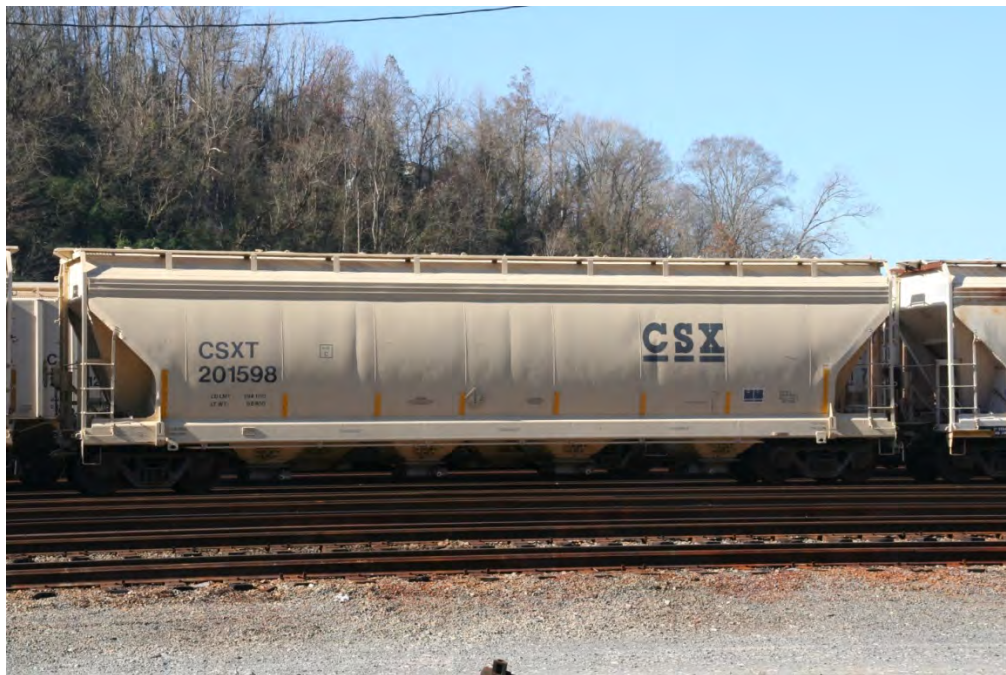
CSXT 201598 is one of 79 steel synthetic lined four bay covered hoppers carrying reporting marks of 201560 through 201639. She is 57 feet 10 inches long, 10 feet 8 inches wide, and 15 feet 6 inches high. She can carry 5,250 cubic feet of product with a weight limit of 263,000 pounds. She is seen at the Paintsville Kentucky Yard in 2011.