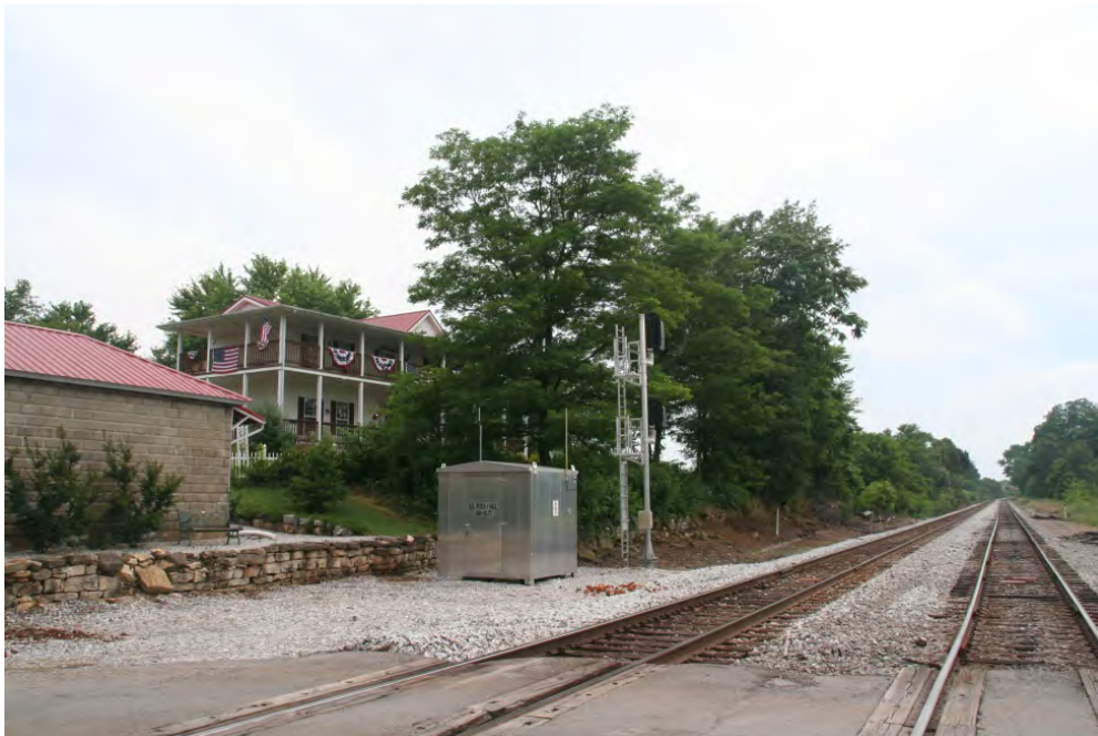
The Rocky Hill Inn B&B sits on a knoll above the CSXT Louisville to Nashville mainline.

The Rocky Hill Inn B&B of Rocky Hill, Kentucky, sits trackside on the old Louisville & Nashville Railroad, Louisville to Nashville mainline, ten miles north of Bowling Green, Kentucky. Just 100 yards north of the B&B, the two lines in front of the B&B collapse to single track. The result is that often a northbound or southbound will be held at the B&B's front door as another train clears the single track. This line sees over 40 train movements a day, including R J Corman's aluminum train and the Glasgow Railroad turn.