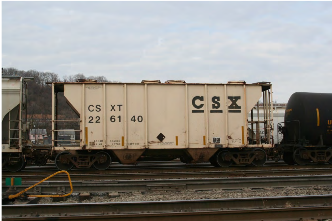
CSXT 226140 is a two bay four loading hatch covered hopper seen at the Russell Kentucky Yard. She is 40 feet long, 10 feet 7 inches wide, and 14 feet 10 inches high. She can carry 263,000 pounds of material within her 2,707 cubic feet holding capacity.