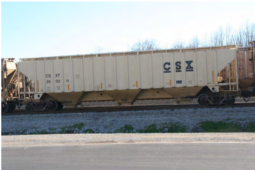
CSXT 250211 is a former Family Line three bay car that has received a full repainting by CSXT. She is seen at the Jeffersonville Indiana Riverport in 2013. She has 662 sister cars. They are 60 feet long, 10 feet 8 inches wide, 15 feet 1 inch tall and can carry 263,000 pounds of goods.