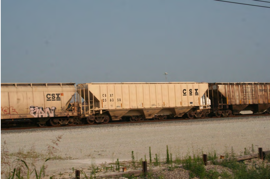
CSXT 256358, a three bay outside braced covered hopper, was built by Pullman Standard as C&O 603339. She can carry 200,500 pounds of grain within her 4,740 cubic feet interior. She is 54 feet 9 inches long, 10 feet 8 inches wide, and 15 feet 1 inch high. She is seen at the Louisville Kentucky Osborn Yard in 2012.