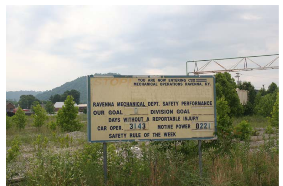
The CSXT Ravenna Car Shop Safety Board still stands some 15 years after the shop closed.