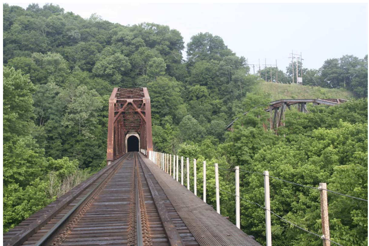
A view from the north bank of the Kentucky River across Bridge #56 and into the portal of Tunnel #8. The top of the bridge to the right marks the abandoned second mainline.