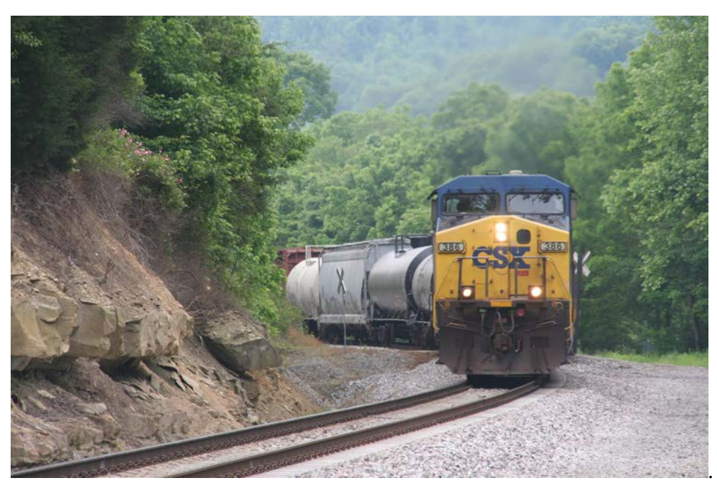
While we were here, a north bound manifested freight roared by, headed by CSXT #386, a GE AC4400CW, and CSXT #661, a GE AC6000CW locomotive.