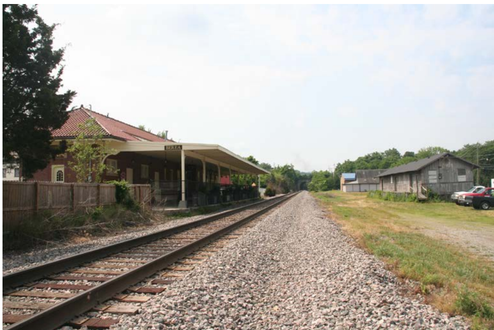
On left is former L&N passenger depot; on right is former L&N freight depot. In center of photo is Tunnel #10.

We continued to follow CSXT southward from Richmond. Our next stop was the Bluegrass Army Ordnance Depot, a major DoD storage facility for artillery shells and rockets. Here we parked roadside to view the DOD Railyard. The yard contained a number of container cars. After a short stop here we ran on to Berea, Kentucky. Here we were given a guided tour of the former L&N Depot. It had been sold to the city of Berea by the L&N and is used as their visitor center. Just south of the depot is Tunnel #10 and on the other side of the track is the former L&N freight depot. The freight depot is no longer used by CSXT and has been sold to a private individual.