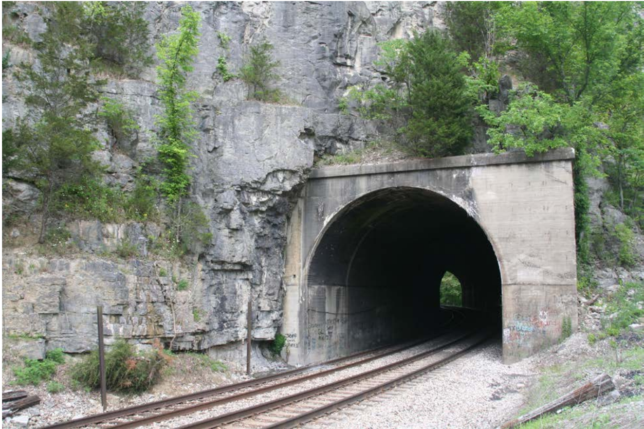
The south portal of the double track Tunnel #18

From Orlando we drove south to Mullins Station and the 360-foot long Tunnel #18. Mullins Station was at one time a prosperous village. The site was originally developed to mine limestone, and the caverns that led back into the hillside still remain east of the CSXT mainline. Later the area was used as a coal loadout, evidence of which can be seen in the coal dust covering the ground. Of the L&N Yard that had once been located here, only a long lead that runs back to an explosive manufacturing plant remains. CSXT generally drops off a covered hopper or two to this facility every week. The west tunnel is no longer used and the east tunnel is double tracked. It was at this location that we met a local who carefully questioned us to determine why we were in the area. After being assured that we were only railfans, we learned from him all that was wrong with the Obama Administration, in particular its hostility to coal mining and the cutting of timber, plus its crusade against tobacco. All three of these endeavors were/are the legitimate life blood of this area's economy.