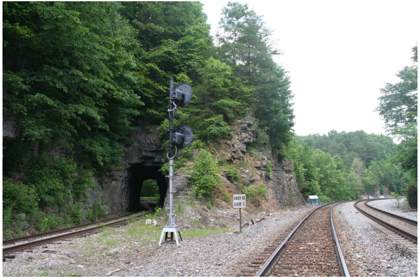
Looking north at Sinks on the left is the Old Lebanon Line and on the right is the line to Winchester. The sign reads "ENTER CC- LEAVE C." Note trackside tent above the sign.

Up through 1980, Sinks was an important location on the L&N. It was here the Lebanon Branch was joined by the KC. While no community evolved at this site, there was located here a station operator and a switch. A major flood circa 1980 and the building of a flood control dam led CSXT to abandon the central portion of the Lebanon Line. Some 20 feet west of the present day CSXT C-C Line is Lebanon Line Tunnel #5. From Sinks south the CSXT mainline is now based on Lebanon Line mile posts. Control of exiting and entering the Lebanon Line to Mt. Vernon is by a remote control switch which is governed by a remote control dwarf signal.