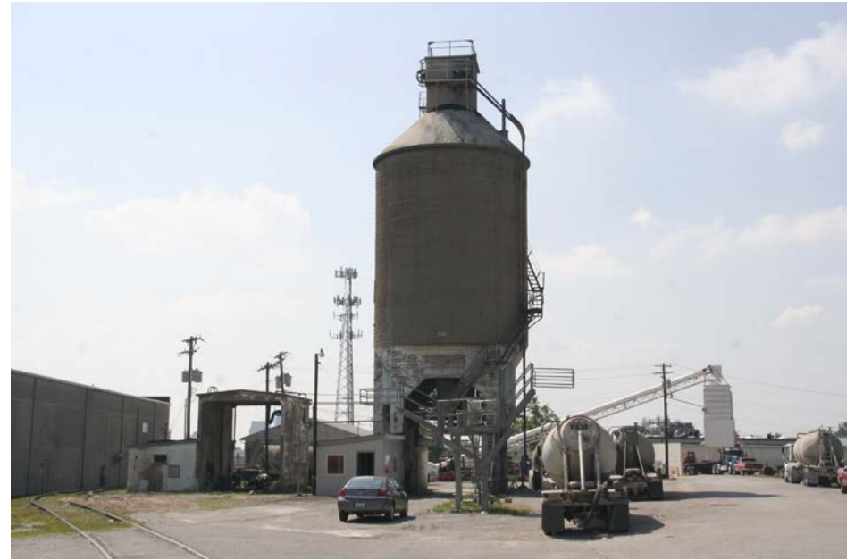
The former C&O coaling tower now used by a private contractor for sand storage

vehicles to this facility. CSXT brings the vehicles to Patio Yard for hand off to Corman. While a number of logistic vehicles could be seen inside the fenced area, we decided not to try and photograph them. With this visit completed, we returned to the motel.