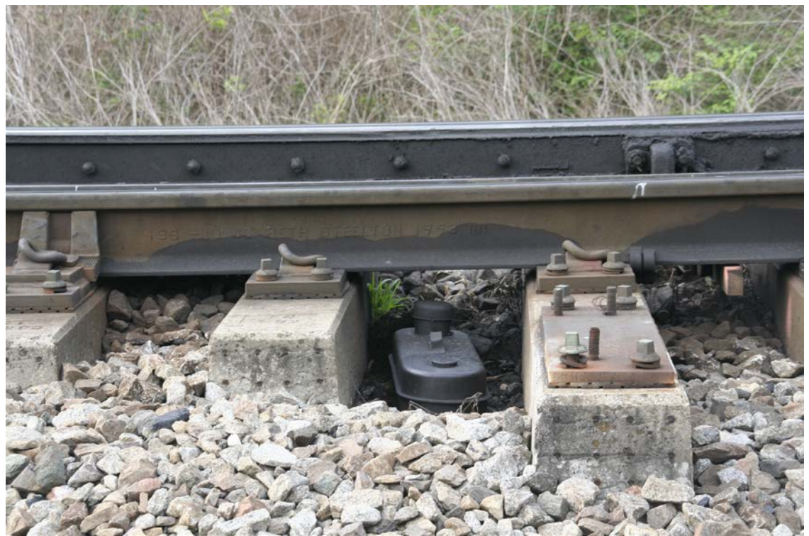
A kerosene heater rests under the switch points ready to heat the rails this winter.