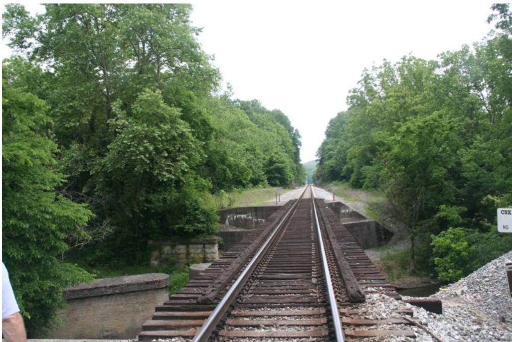
Looking north over Bridge #67 at daylighted Tunnel #13. Hidden in the trees on the left is the abandoned Tunnel #13.

journey was the absence of their building plates. These had all been in place in January 2013 when I had last run the line. I'm not sure if these plates were taken by a railfan or a scrapper, but some railroad history had been lost.