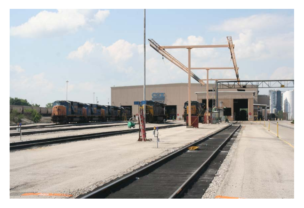
Above and below is CSXT's main Corbin locomotive repair shop.