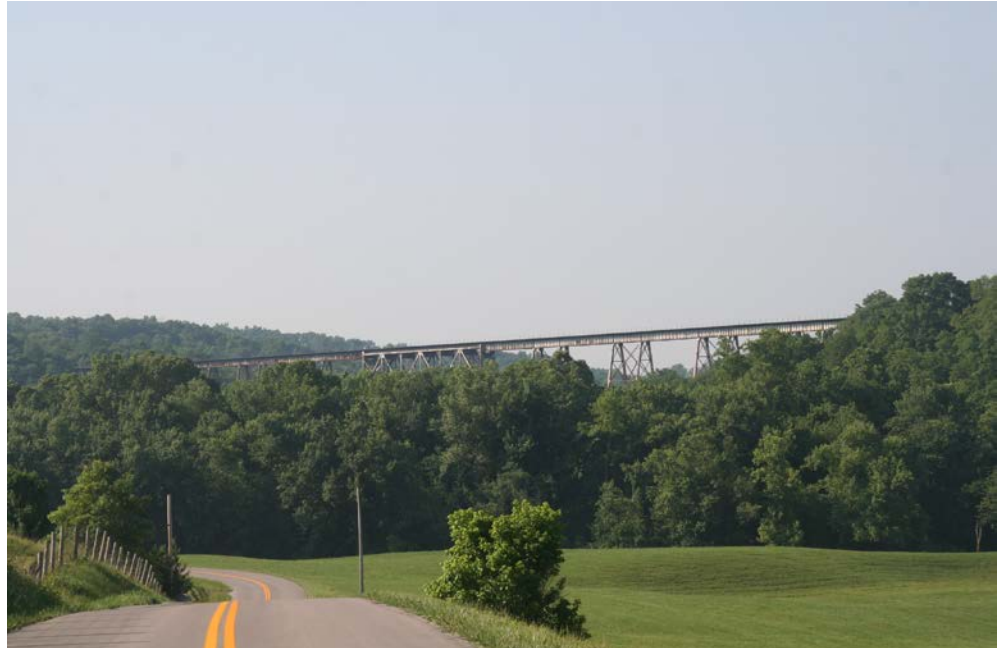
The Red River Gorge Trestle

owners no longer cutting back tree growth along the rail line, viewing of the trestle is reduced a little bit more each year. After viewing the Red River Gorge Trestle, we drove to the 70-foot high Galloway Creek Trestle. This trestle, upon being viewed from its base, was completely hidden behind a canopy of trees, and thus only glimpses of its structure could be ascertained. Much of the EK Line can only be viewed during the winter when trees are stripped of their leaves.