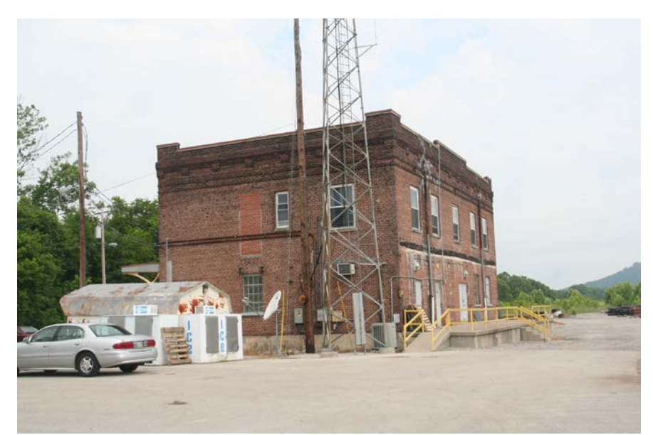
This former L&N store house is the only ex-L&N building still standing in the Ravenna Yard. Today it houses the CSXT signal gang.

After our tour of Ravenna Yard, we drove south for Texola, Kentucky. Texola was the site of a Texaco refinery that was served by the L&N from 1930 to 1960. The plant still stands but the rail yard is gone. The Ravenna area sat on top of an extensive pool of pure oil and, for a time, Kentucky rivaled Texas, but the pool was shallow and was quickly pumped dry. In 1980, there was a plan to bring the refinery back on line. It was to be used to refine gasoline being captured from underground gasoline tanks located at abandoned gasoline stations. This plan fell through, and then in 1990 the plant was to have again come back on line to reformulate used motor oil. This proposal also collapsed when government funding was withdrawn. At Texola, CSXT has a mainline scale for weighing coal cars. Up until a few years ago, CSXT accepted the weight of the coal in the car as provided by the shipper. However, when CSXT, circa 2005