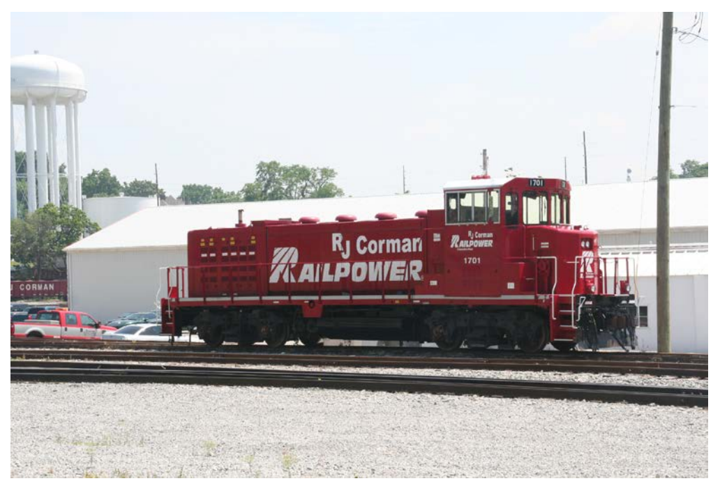
R J Corman Rail Power Technology Genset #1701 at Lexington Yard

Our tour of the R J Corman Yard included viewing Corman's two Green Power locomotives: Railpower #1701, a battery powered GG20B, and Railpower #2012, a Genset. We were told that #1701 may be re-engineered in 2014 as a Genset. We were also given a tour of the locomotive repair facility and were able to observe, from a distance, the turning of one of the wheels on RJCC #8799, an EMD SD40-2. The cutter head removed long thin strips of metal from the rotating wheel as the wheel's optional rail configuration was restored. We were also able to view one of the two passenger cars being converted for a proposed Corman dinner train between Lexington and Versailles, Kentucky. Said service was reported to start in 2014. New in the Corman Yard was an SW1200 switcher that had just been painted Corman red and given reporting marks RJCC #1203; its former reporting marks were MVPB #1203. Our last act was to visit the R J Corman 1986 built Chinese 2-10-2 steam locomotive along with its business car, which is housed in a specially built all glass display building near Rupp Arena. It should be noted that since 2012 many of the senior positions within the R J Corman Rail Group family are held by former CSXT employees.