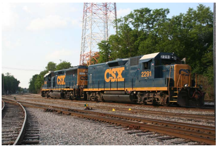
Found at Patio Yard were locomotives CSXT #6937, an EMD GP40-2, and CSXT #2291, an EMD Road Slug.

On Sunday we left the motel at 8:00 AM to explore CSXT's Eastern Kentucky (EK) Subdivision. Our first stop was Patio Yard on the south outskirts of Winchester. Here the C-C, EK, and RJ Corman lines meet. Located in the yard were locomotives CSXT #6937, an EMD GP40-2, and CSXT #2291, an EMD Road Slug, plus a number of flat cars carrying various U.S. Army logistic vehicles, boxcars, covered hoppers, and tank cars. The joining of the EK and C-C track forms a wye at the south end of the yard.