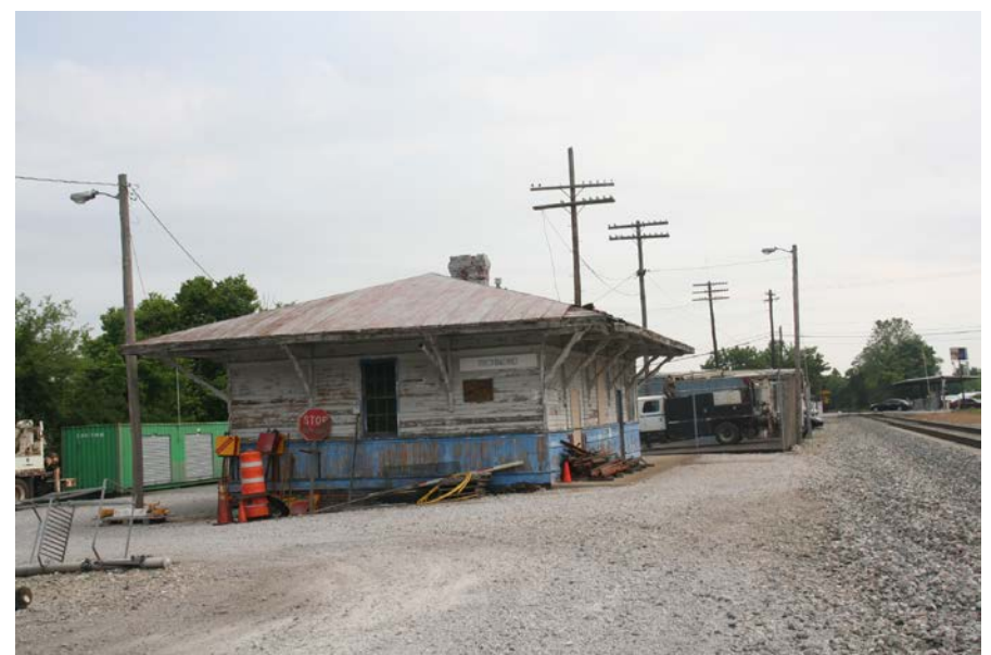
The former L&N freight house at Richmond now houses the local CSXT Signal gang.

Upon leaving Tunnel #9, we followed the CSXT track into Richmond, crossing the only remaining section of Richmond, Nicholasville, Irvine & Beattyville Railroad track still in existence. The track is used by CSXT to reach some industrial sites. At the CSXT Richmond Yard, we photographed the old Railway Express office now used by the CSXT signal gang, inspected CSXT's Kentucky Valley helpers CSXT #608 and 611, both GE AC6000CW locomotives, and caught a north bound eighty-nine car coal train headed by CSXT #331 and CSXT #432, both GE AC4400CW locomotives. The helpers based at Richmond are used to provide extra dynamic braking when descending the 61,569 foot long 0.63 percent grade Richmond Hill and muscle power when ascending the 0.81 percent grade Winchester Hill.