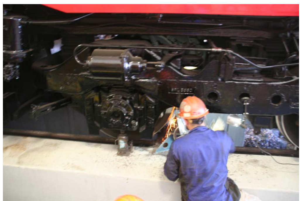
During our visit to the locomotive repair facility, we were able to observe a locomotive's wheel being cut to bring it back into specification.