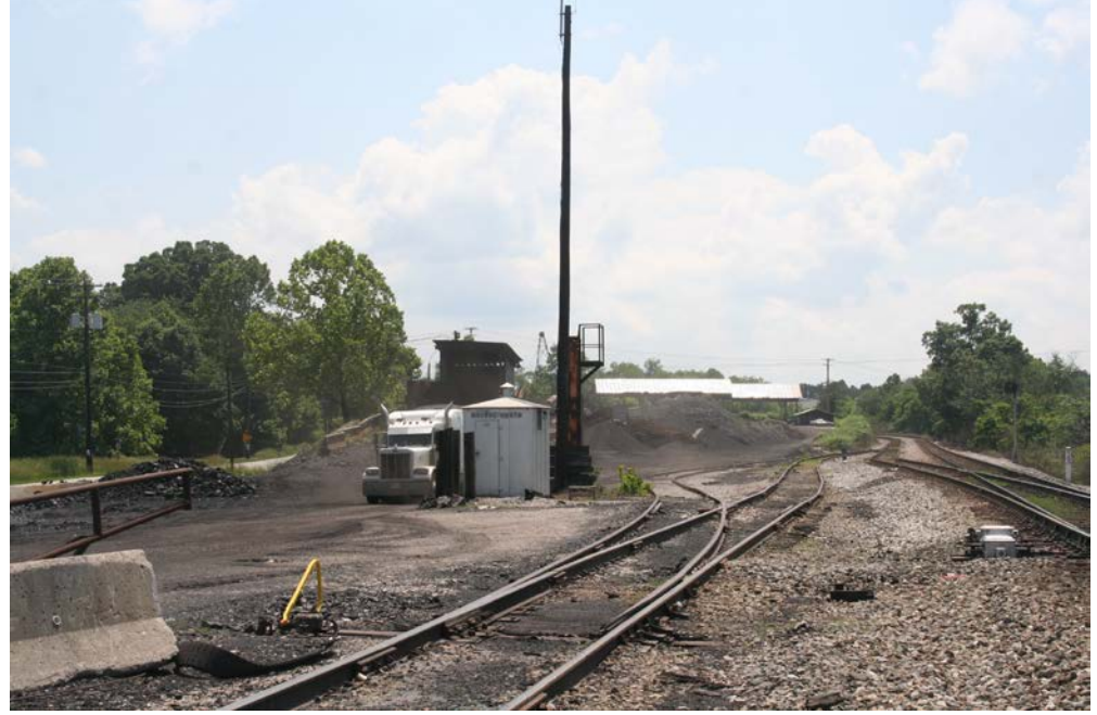
The coal loadout at East Bernstadt

small coal loadout appeared to be closed even though a coal bucket was dropping off a load of coal next to the tipple.