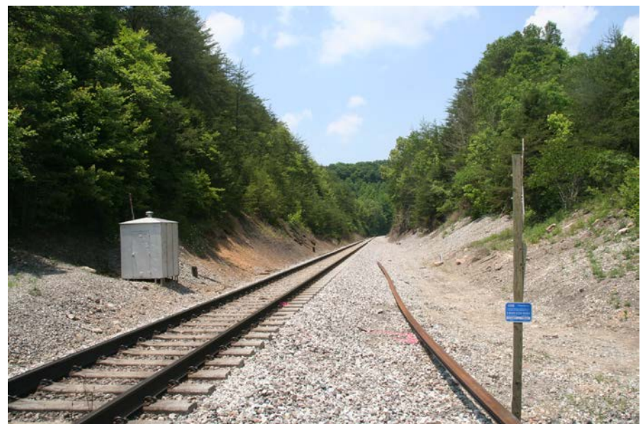
The daylighted Lebanon Branch Tunnel #5 with its equipment dragging detector box. The abandoned Tunnel #5 is buried in the hillside to the right.