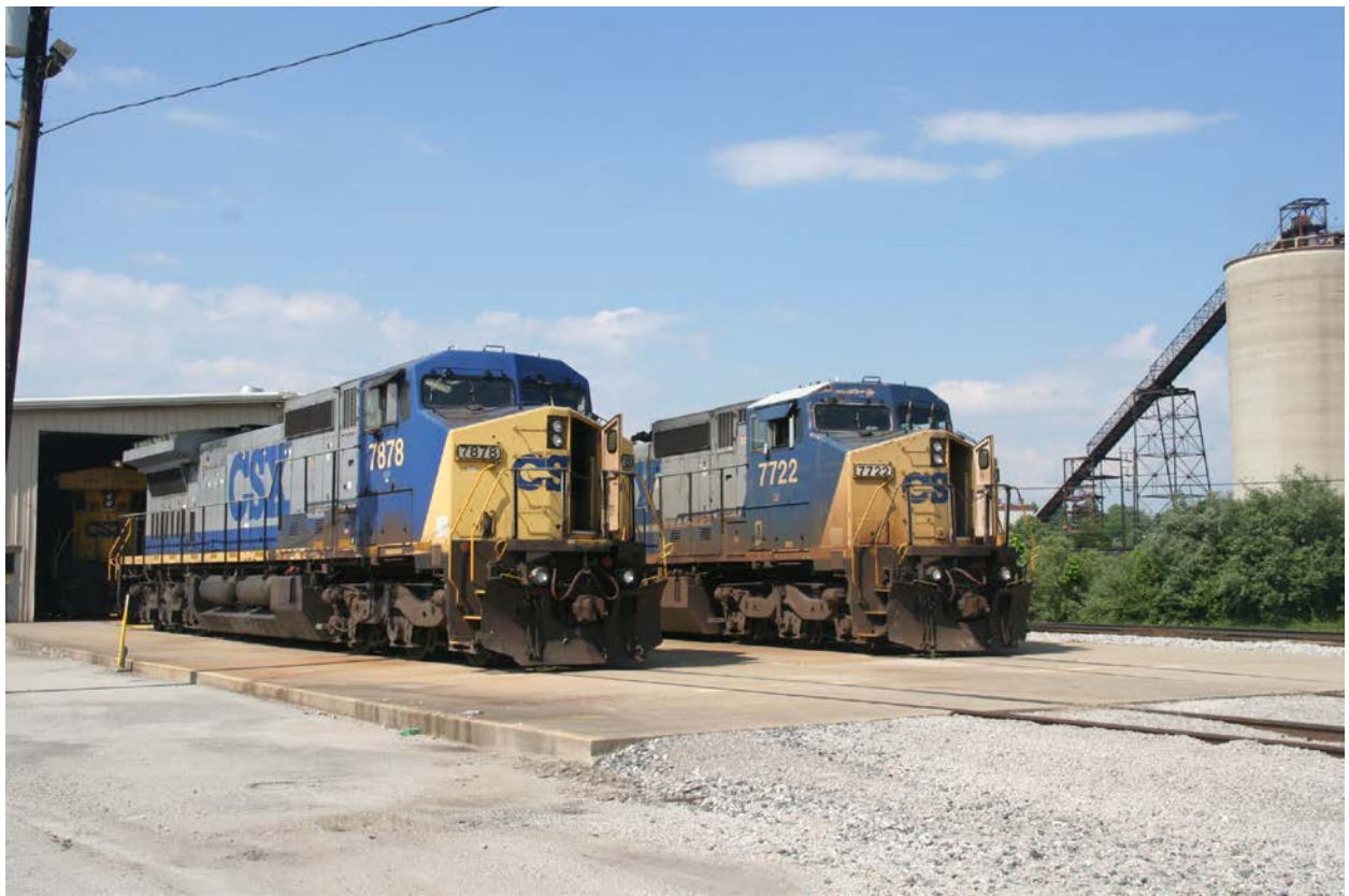
Above is the CSXT Corbin running repair shop. To the right of the locomotives is the former US Steel coal wash plant.

roadway the GE and the EMD locomotive service facilities. I counted 48 CSXT locomotives sitting outside the two locomotive service facilities. We also visited the coal hopper storage yard, which was filled with empty coal hoppers seeking a load of coal. Buried within this fleet of hoppers were two cars still sporting C&O paint and reporting marks. The U.S. Steel Coal Preparation Plant, immediately to the east of the Corbin Yard, which had been brought back on line in the 1990s, was closed and shuttered. Coal production in Kentucky is but 50 percent of what it was ten years ago, and during the Convention the news media announced the closing of more coal mines in Eastern Kentucky are way down from ten years ago. However, during our tour of the Corbin Yard, we saw but one empty unit coal train arrive, headed by locomotives CSXT #501, a GE AC4400CW-H, and CSXT #22, a GE AC4400CW, and a loaded string of hopper coal cars being fitted with power, CSXT #991 and CSXT #992, both GE ES44AC-H locomotives, to head south. With the clock showing 5:00 PM, we left Corbin Yard to return to our motel in Winchester.