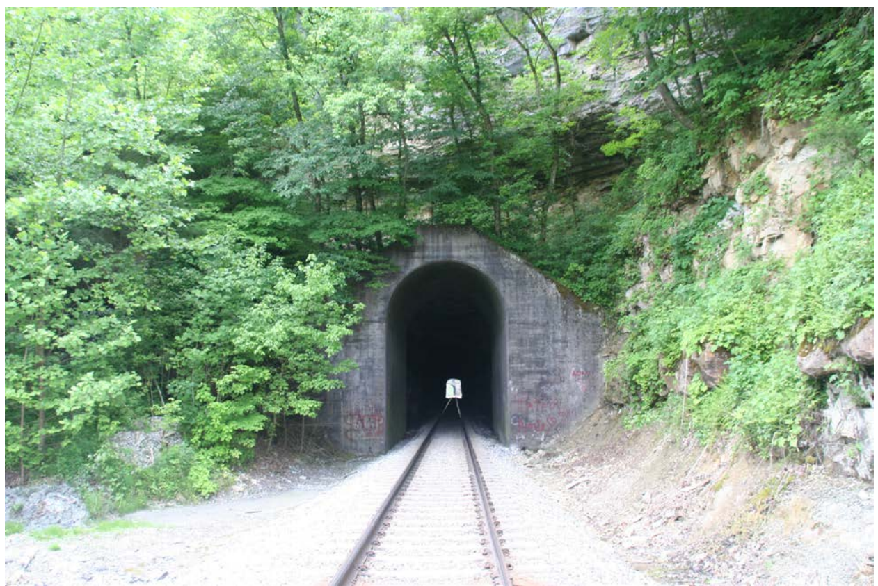
Looking south through Tunnel #14 at Tunnel #15

Our next stop was the Twin Tunnels, Tunnels # 14 and #15. Roundstone Creek just north of Orlando, Kentucky, makes an "S" curve. The Kentucky Central Railroad, in building south through this area, was forced by topography to construct three bridges and two tunnels to cross Roundstone Creek. Within less than a half a mile, the track crosses Roundstone by Bridge #68, and then runs on a shelf for 100 feet before entering Tunnel #14. The tunnel's track exits onto another 100 foot wide shelf that in turn forms the north abutment of Bridge #69 which crosses Roundstone Creek. Bridge #69 provides direct entrance to Tunnel #15 which is exited by directly crossing Roundstone Creek on Bridge #70. These two tunnels are referred to by locomotive crews as the "Needle's Eye." Interestingly, at this location, the railroad uses the west tunnels, with the east Tunnel #14 and the daylighted Tunnel #15 given over to nature. Tunnel #14, at 896 feet in length, is the third longest tunnel on the C-C. Tunnel #15 is the shortest at 69 feet.