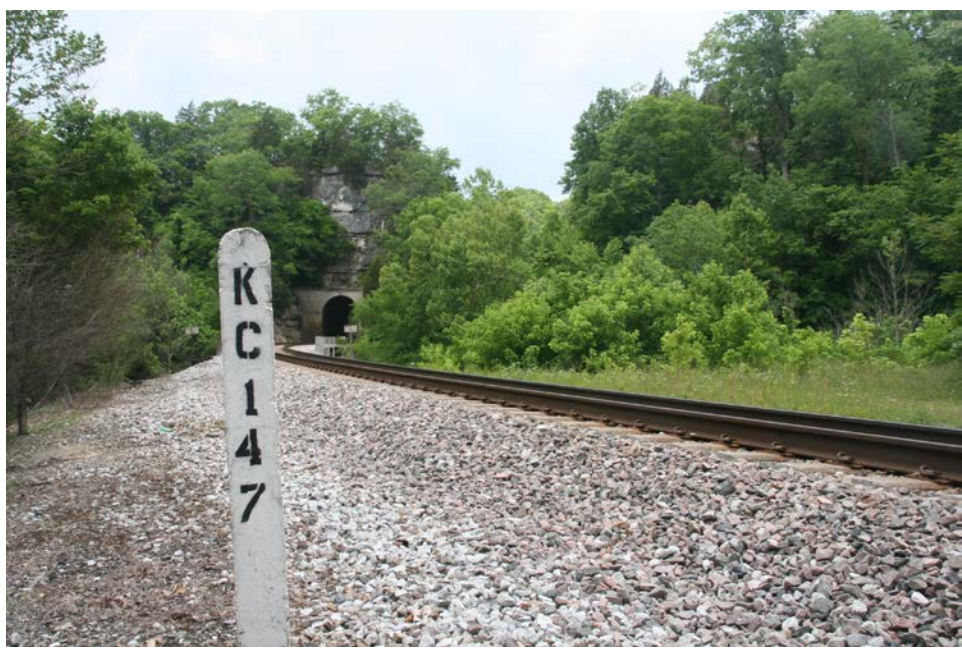
Tunnel #15 in the distance. The cut of the abandoned daylighted Tunnel #15 can be seen to the right of the existing tunnel.

After viewing both tunnels and bridges, we drove into Orlando, a village in the process of becoming a ghost town. The general store and gasoline station have long been closed. Orlando had once been the location of an important railyard for L&N. At one time Orlando served, via a branch line, the bridge pillars of which are still visible in Roundstone Creek, a number of coal mines located at Johnetta, Kentucky. At a later date, the Orlando Yard contained a truck served coal loadout facility. The site of the former yard provides an excellent view northward of Tunnels #15 and #14.