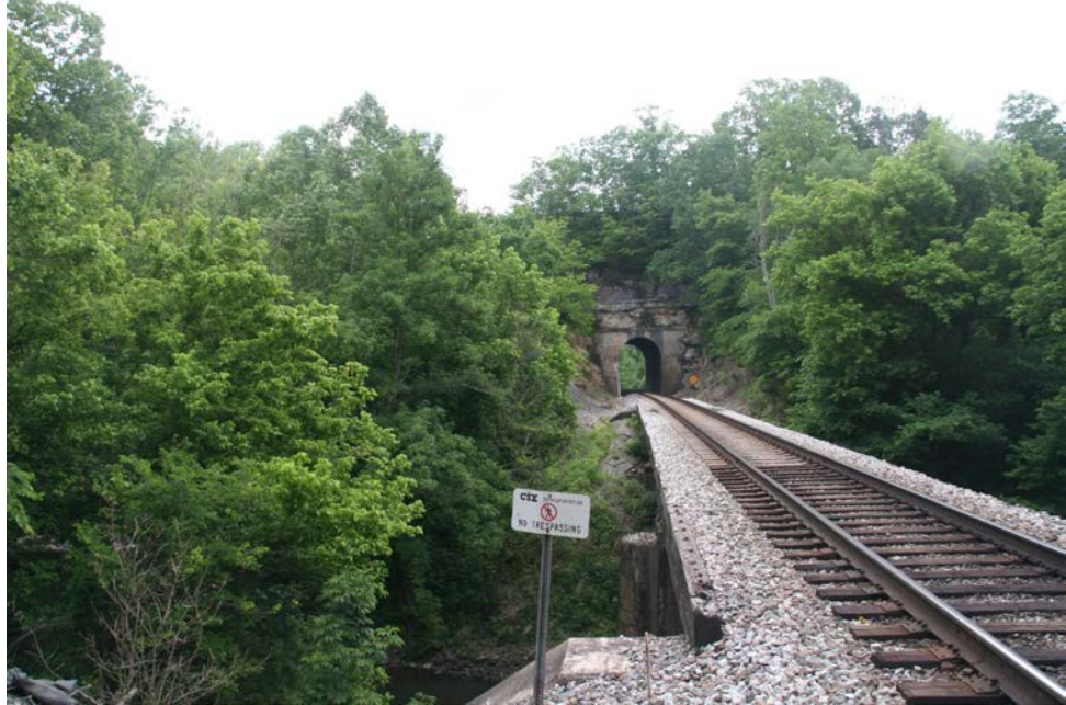
Looking north over Bridge #70 at Tunnel #15

After viewing both tunnels and bridges, we drove into Orlando, a village in the process of becoming a ghost town. The general store and gasoline station have long been closed. Orlando had once been the location of an important railyard for L&N. At one time Orlando served, via a branch line, the bridge pillars of which are still visible in Roundstone Creek, a number of coal mines located at Johnetta, Kentucky. At a later date, the Orlando Yard contained a truck served coal loadout facility. The site of the former yard provides an excellent view northward of Tunnels #15 and #14.