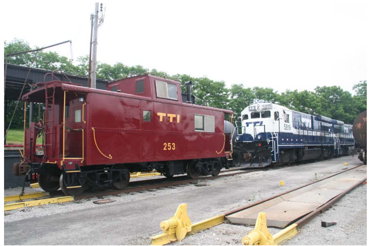
TTI #253 serves as the line's business car. To the rear of her are TTI #5819 and #5802, both GE B36-7s.