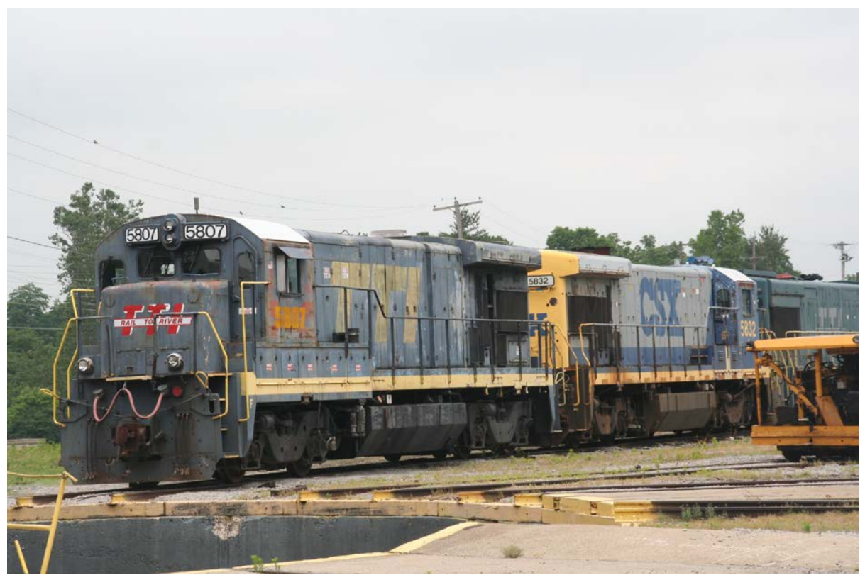
TTI #5807, ex CSXT #5807, and ex CSXT #5832, both GE B36-7s, sit in the TTI spare part line.