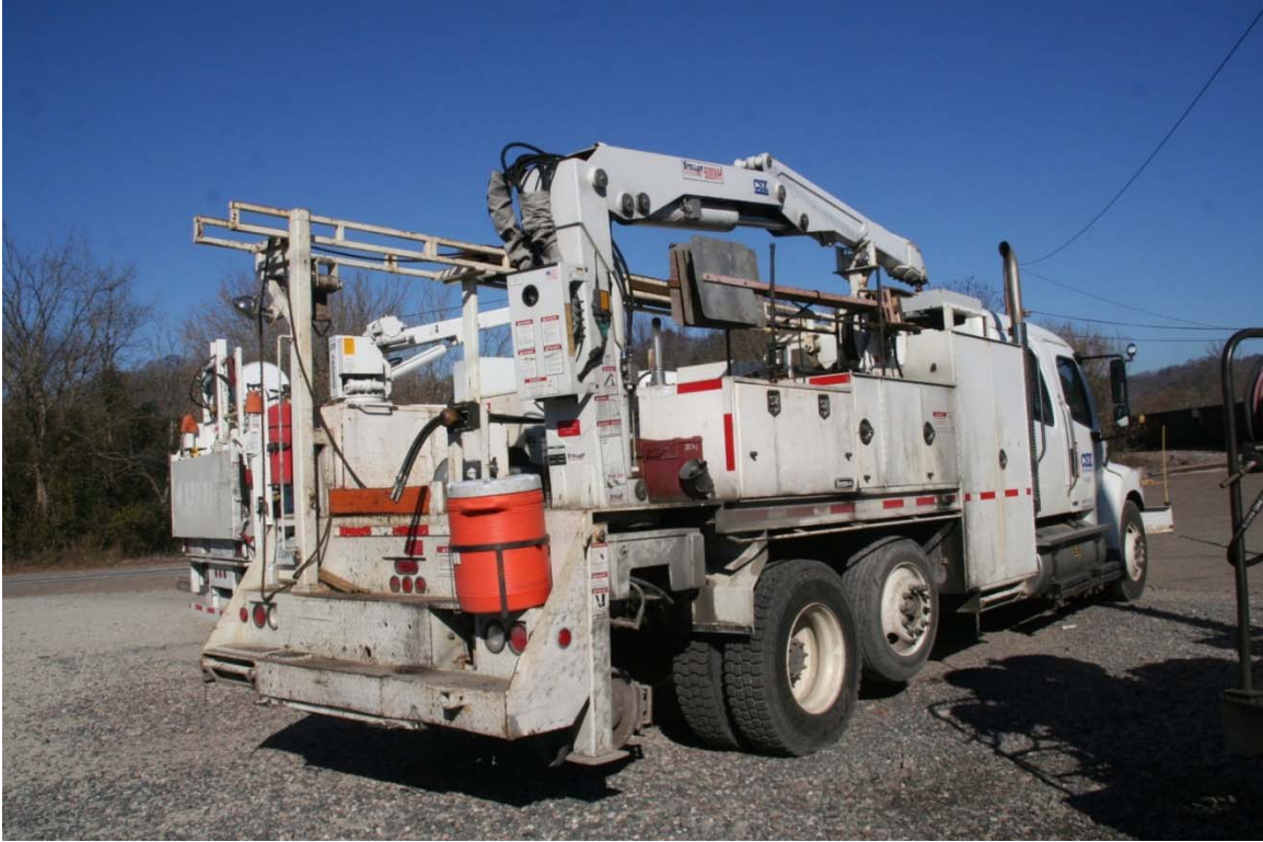
A CSXT Maintenance-of-Way truck used by track gangs to change out broken rails.