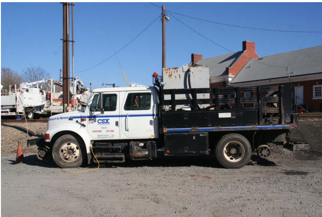
CSXT 306020, a Maintenance-of-Way Gang truck, is seen at Paintsville, Kentucky.