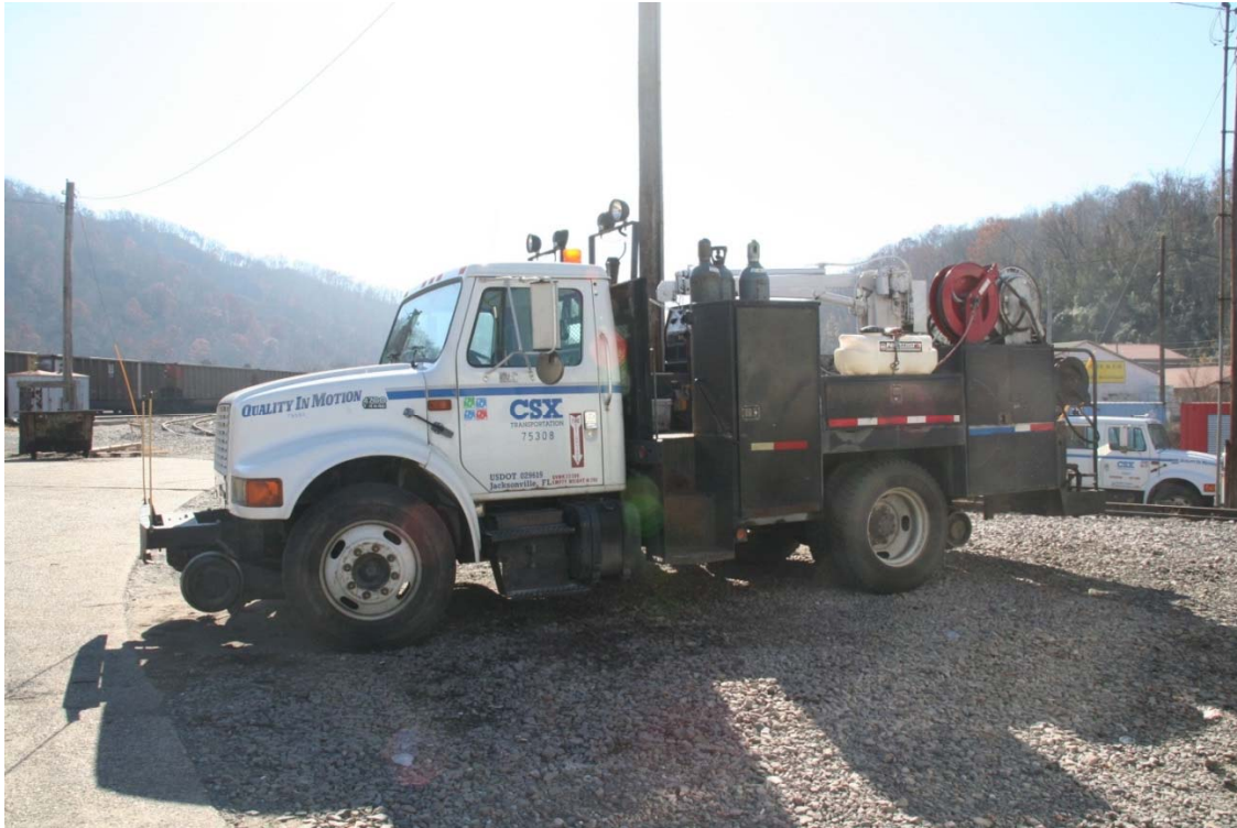
CSXT 75308, a welding truck