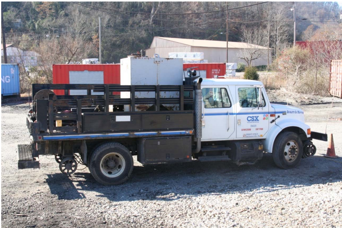
CSXT 306020 is a Heavy Equipment, Stack Bed, Gang Truck.