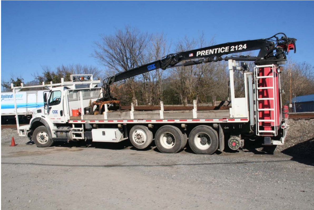
Above and below: CSXT 620055, a grapple truck used by Maintenance-of-Way gangs for lifting and carrying ties or rails. She is seen near Columbus, Ohio.