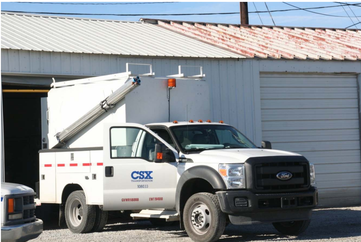
CSXT 108033, an Electrician's Truck, is seen at Queensgate.