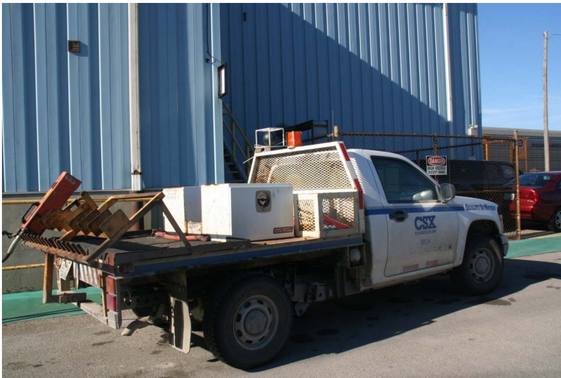
CSXT 50134, a yard truck used at Birmingham, Alabama, to carry FREDs to trains leaving the yard and to retrieve FREDs from trains arriving in the yard.