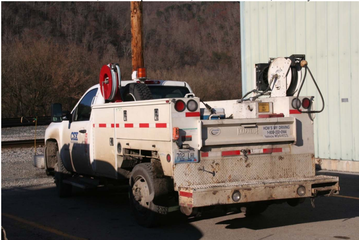
A Track Inspector truck is parked at Shelby Yard.