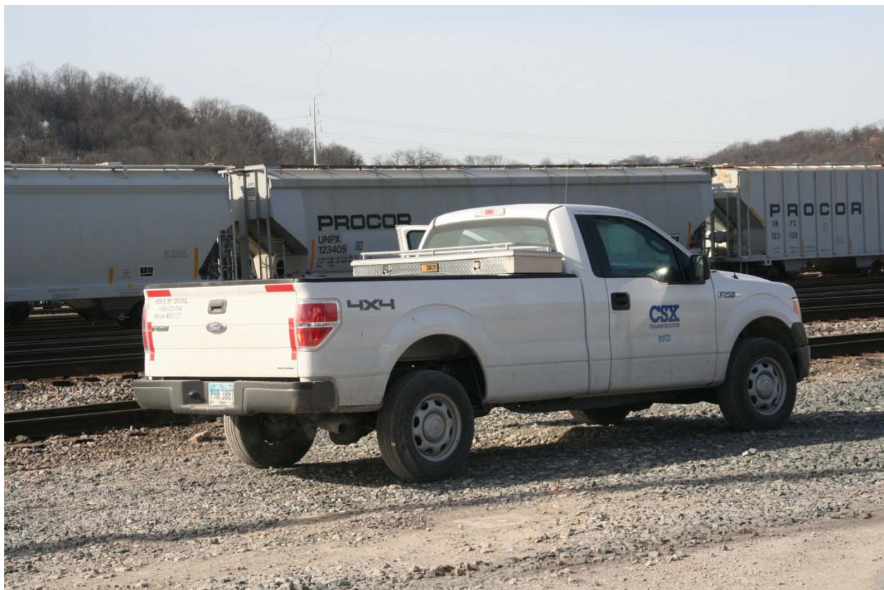
CSXT 80121 is a general purpose truck often referred to as a Flagman Truck.