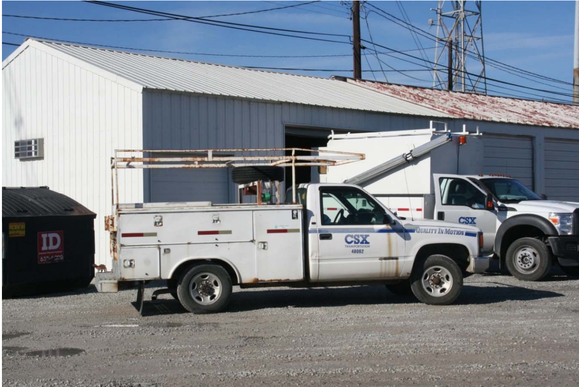
CSXT 48062, an Electrician's Truck, is seen at Queensgate.