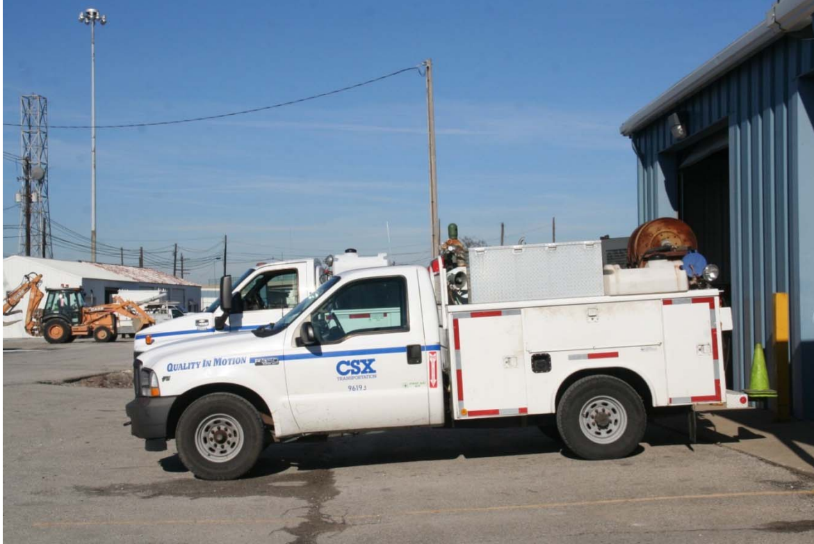
CSXT 96193, a carpenter truck used by a Bridge Team