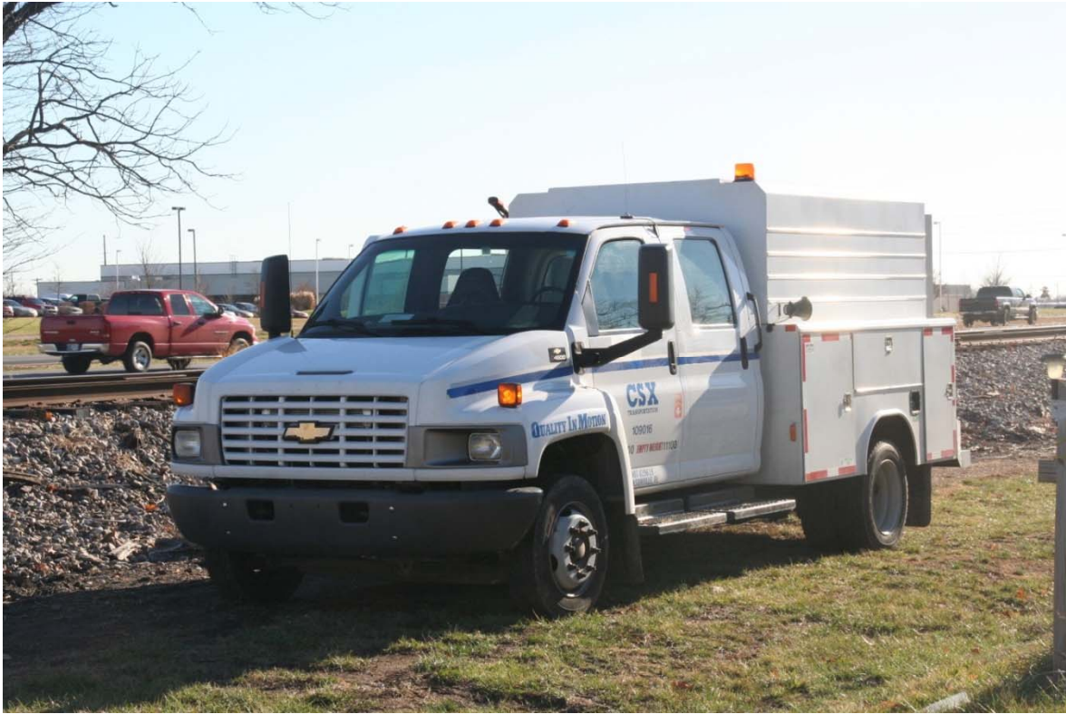
Above and below: CSXT 109016, a "War Wagon" Signal Gang Truck, at Jeffersonville, Indiana.