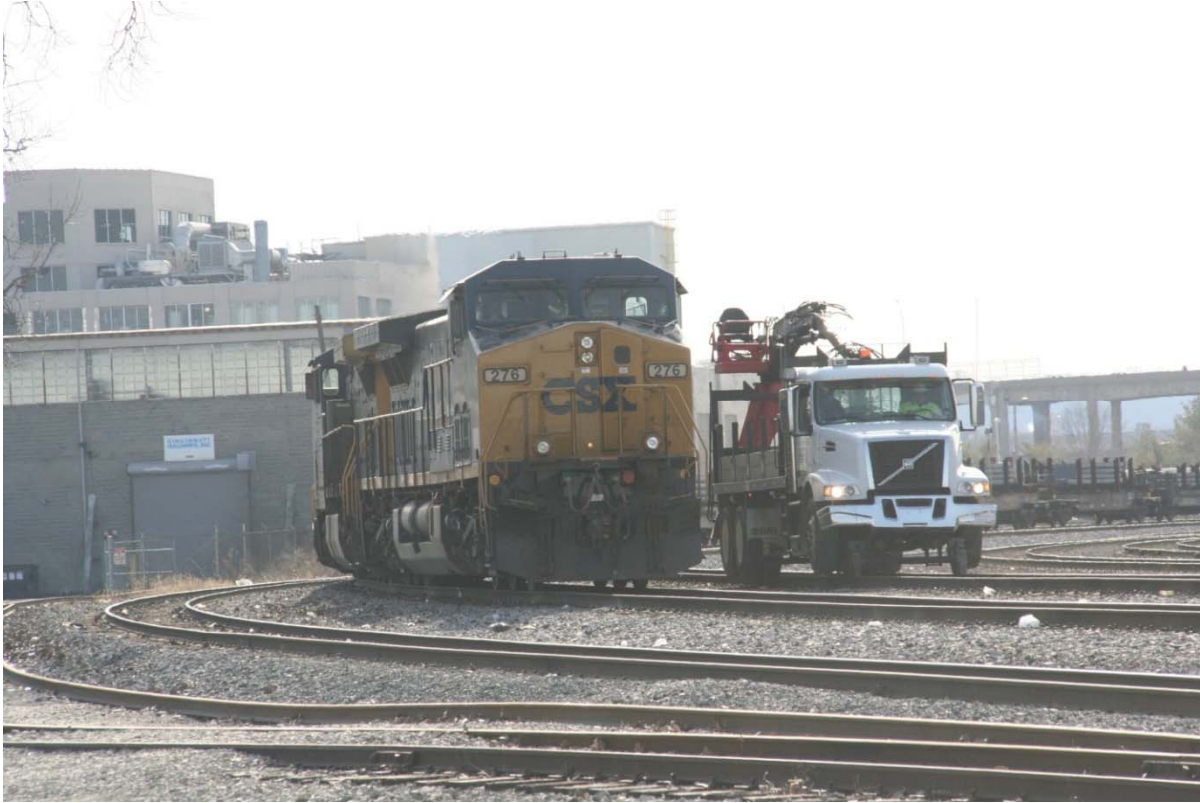
Above and below: A CSXT boom truck is seen at Queensgate Yard heading north to deliver ties to a track gang working on one of the yard tracks.