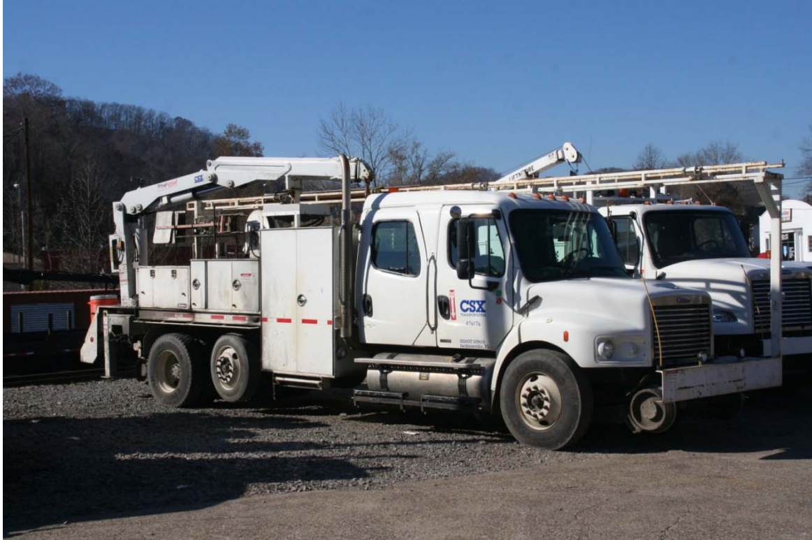
Above and below: CSXT 476176 is a Section Gang or Basic Force Truck.