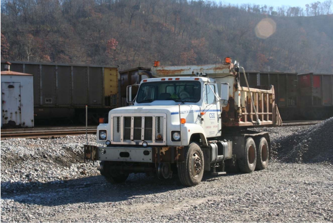
CSXT 70711, a three way dump truck, can dump to the rear or to either side.