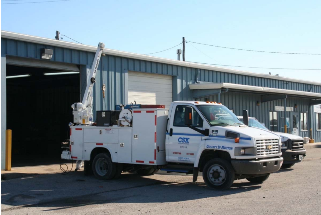
CSXT 139034 above and CSXT 139013 below, area road mechanic truck used for repairing Maintenance-of-Way equipment.