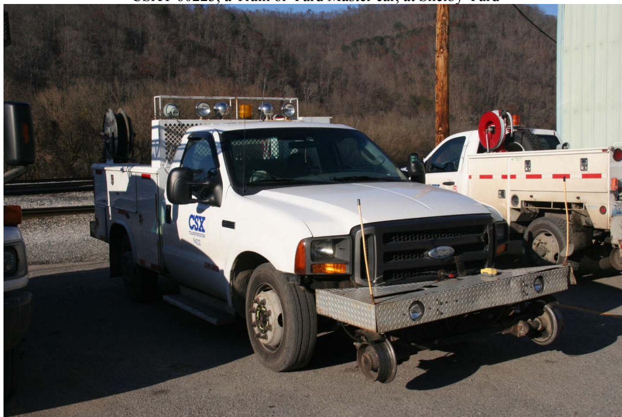
CSXT 94212, a track inspector truck, at Shelby Yard