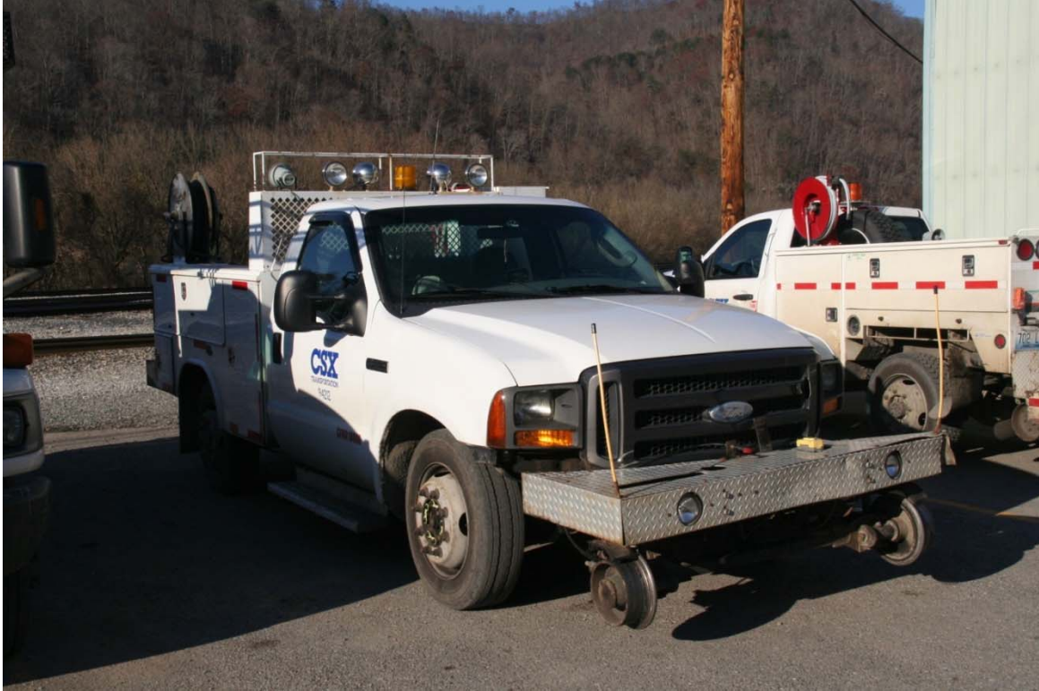
CSXT 94212, a track inspection truck, is seen at Shelbiana, Kentucky.