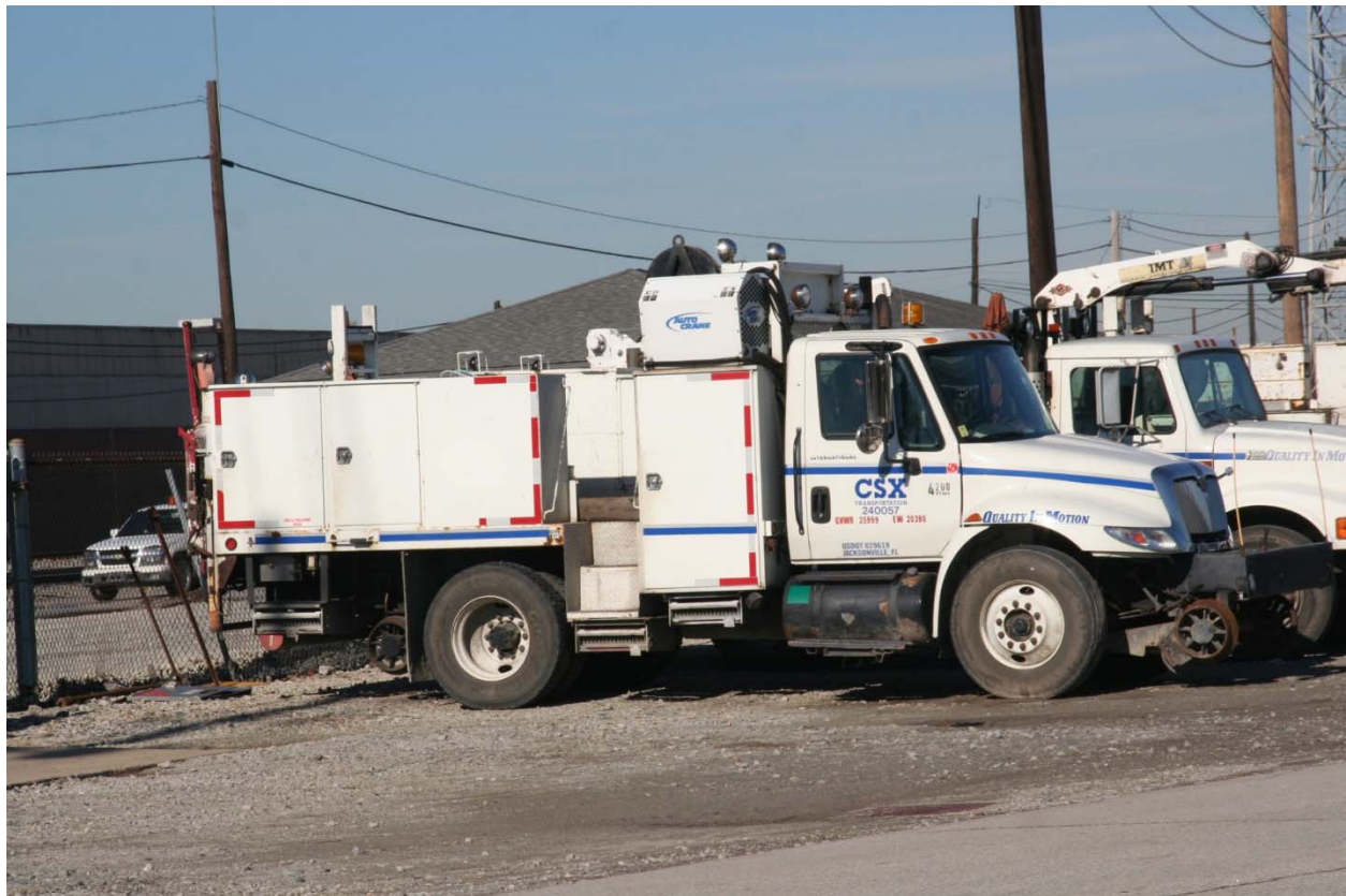
CSXT 240057, a rail welding truck