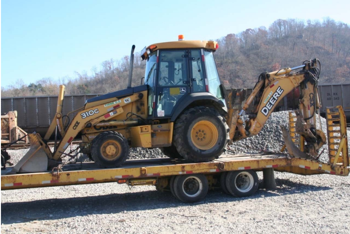
CSXT backhoe on trailer at Paintsville, Kentucky