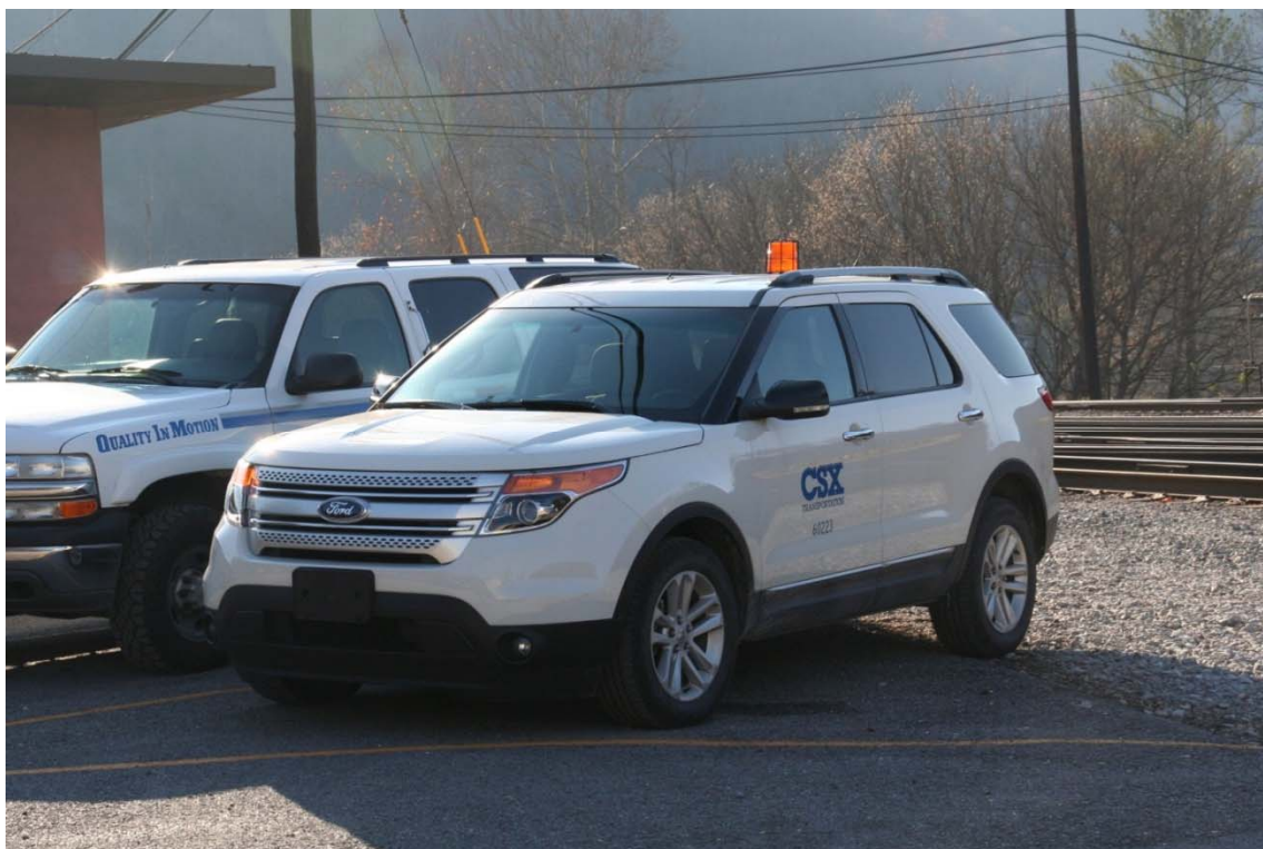
CSXT 60223, a Train or Yard Master car, at Shelby Yard