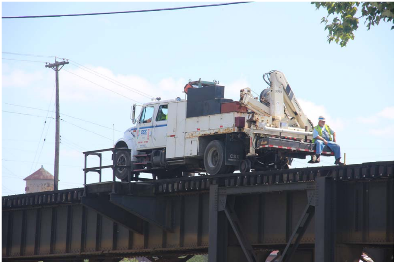
A CSXT track gang truck, with boom, is seen at Cincinnati, Ohio, on the approach to the Ohio River Bridge.