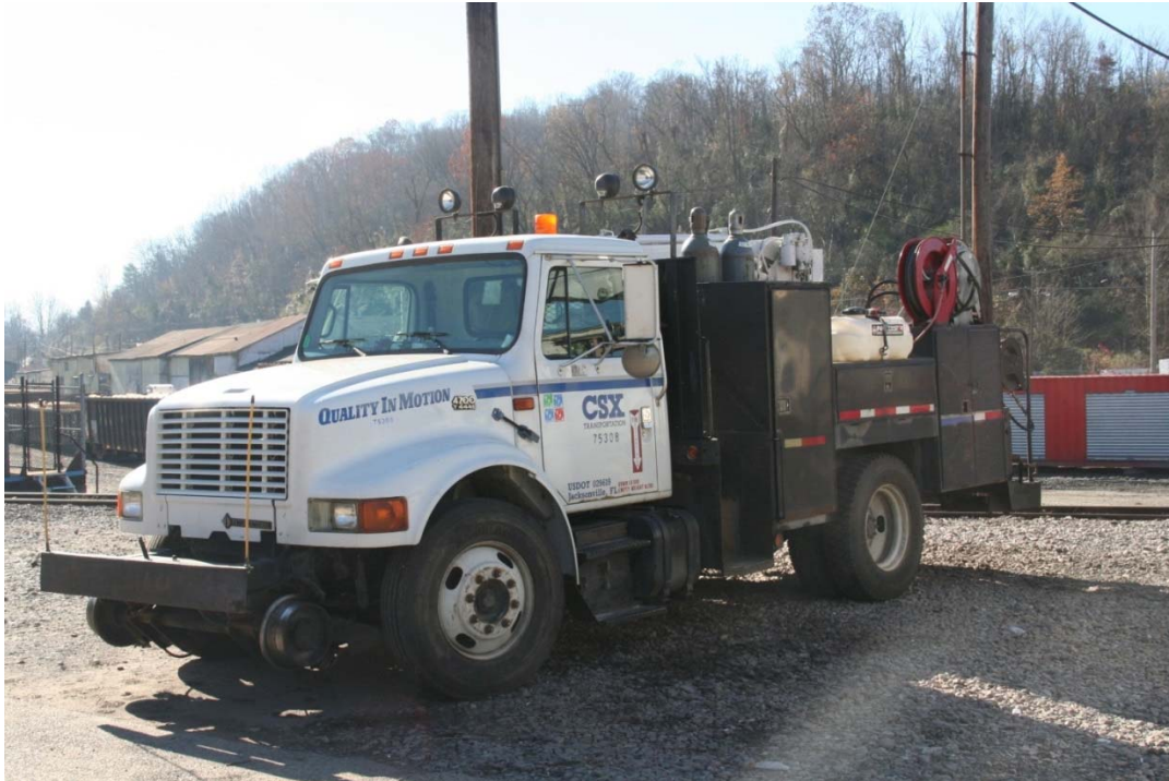
CSXT 75308 is a welding truck.