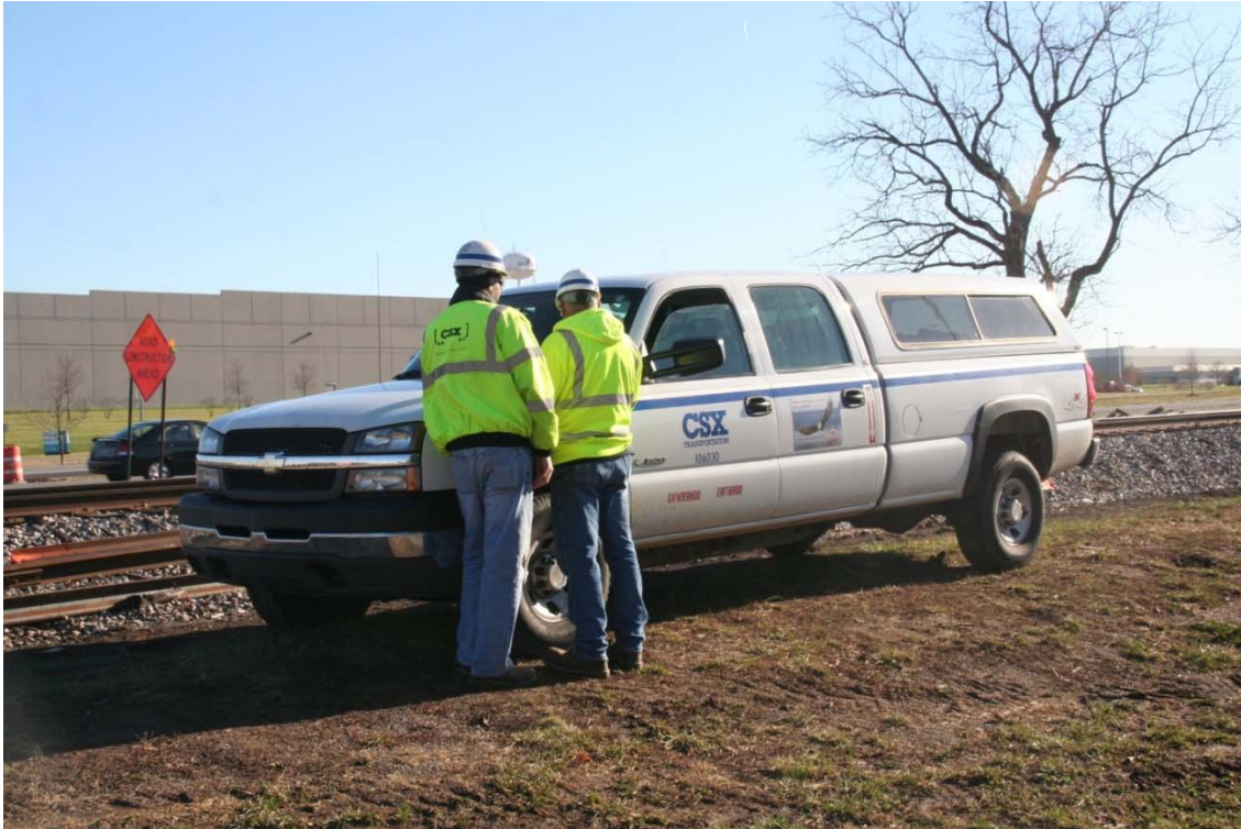
Above and below: CSXT 106030, a Maintenance-of-Way foreman truck, is seen at Jeffersonville, Indiana. The sign on the truck's rear door reads, "Safety starts with an action not a reaction" "Western Region Construction." Under the eagle's feet is the logo of the Monon Railroad, a fallen flag railroad incorporated into CSXT.