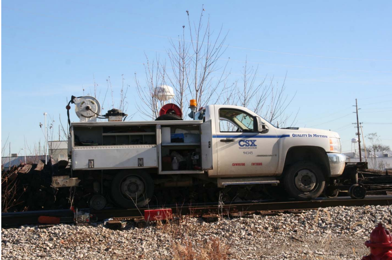
On the cover and above is CSXT 94345, a track inspector truck.