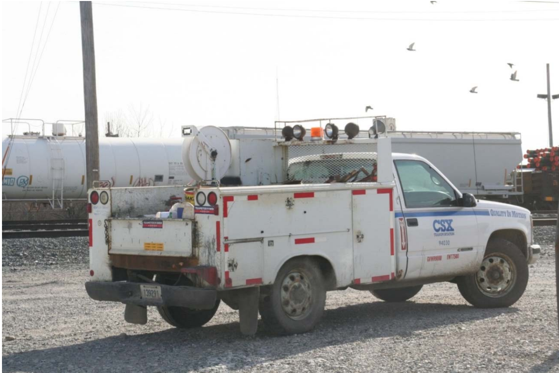
CSXT 94030 is a track inspection truck.