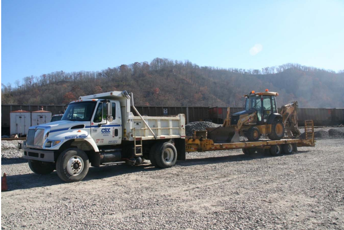
Above and below: CSXT 450056, a dump truck with a trailer in tow that is carrying a back hoe, is seen at Paintsville, Kentucky.