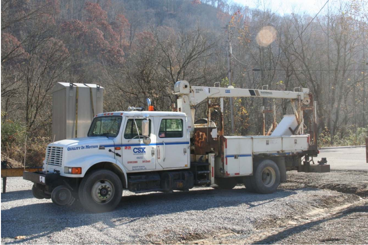
CSXT 486002, a Signal Gang bucket truck