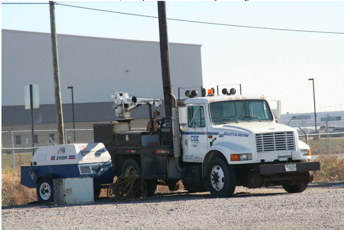
CSXT 75305 is a Welder Truck.