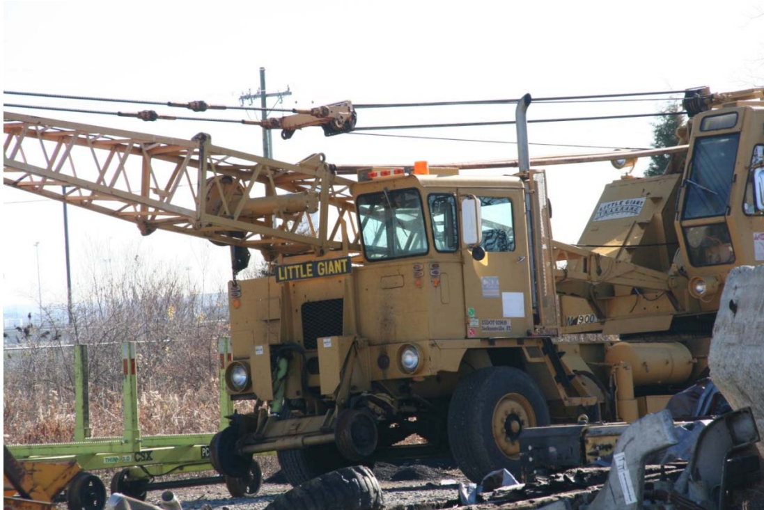
Above and below: A Little Giant Cable Clutch Lifting Crane at Osborn Yard, Louisville, Kentucky