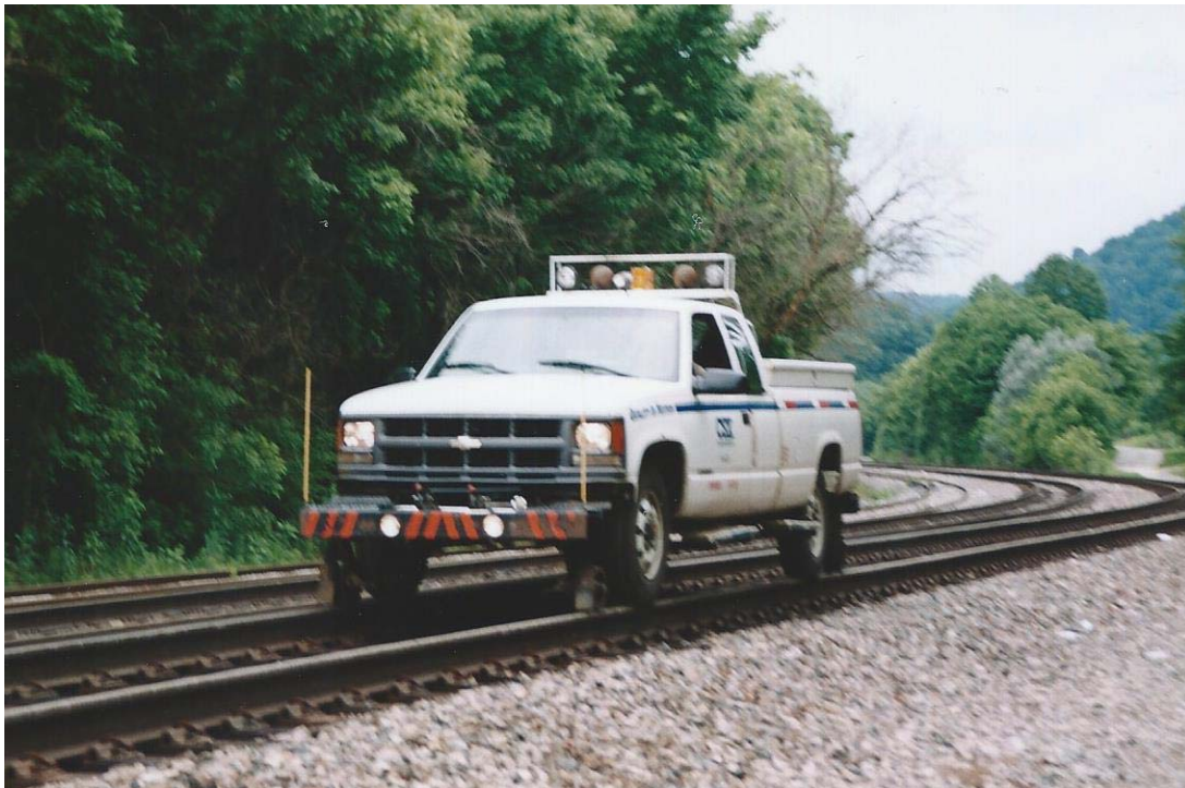
A CSXT track inspection truck is seen near St. Albans, West Virginia.