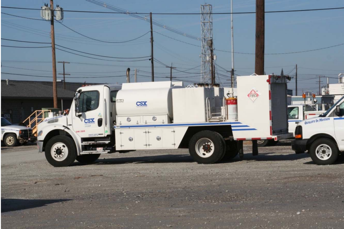
CSXT 393009, a fuel truck used for refueling track gang equipment.