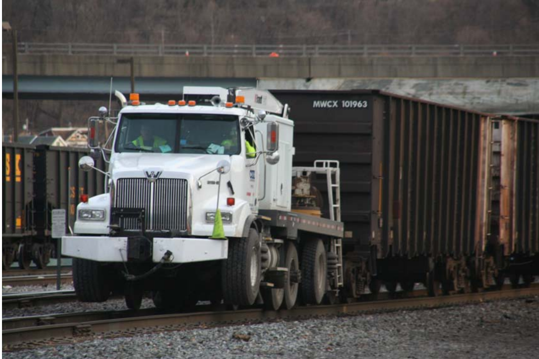
Above and below: CSXT 999011 is a Brandt Truck. It is used by Section Gangs for track repair but can also be used for moving freight cars. Here CSXT 999011 is moving a string of wood chip hoppers at Cumberland, Maryland.