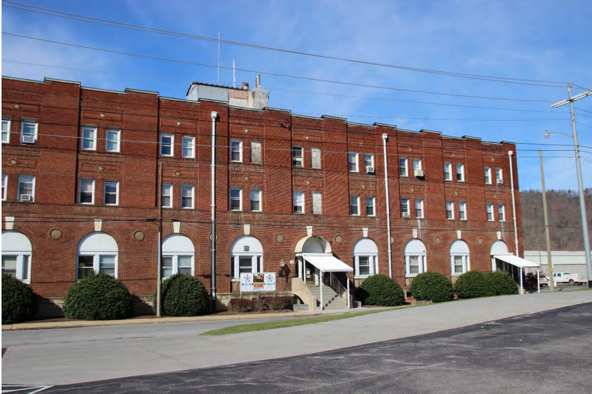
A street side view of the CSXT Office Building