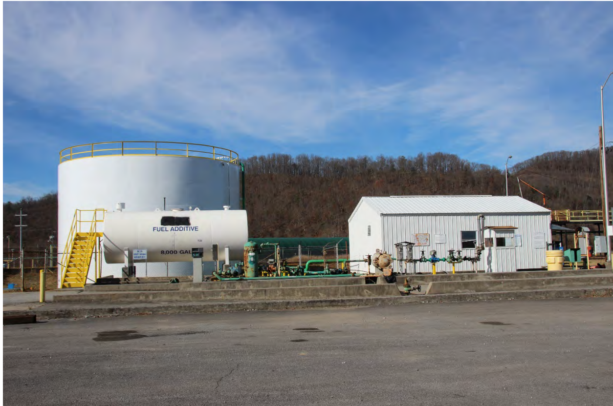
Above and below are views of the Erwin Yard fuel storage facility.