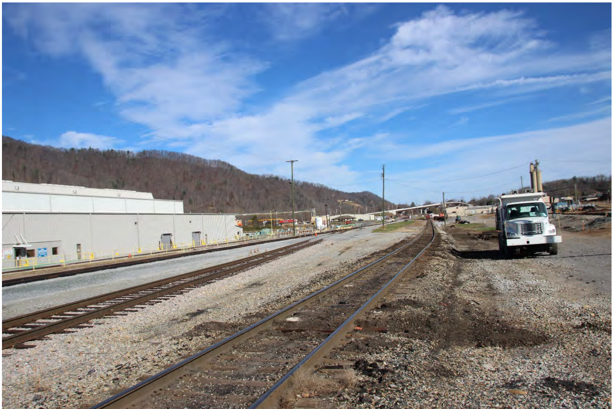
A view north from the north end of Erwin Yard. The car repair shop is on the left.