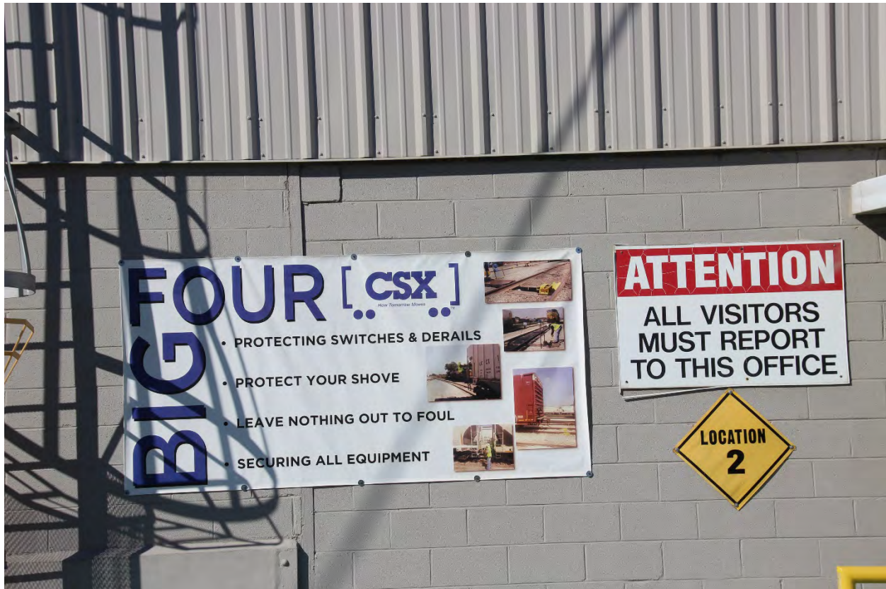
A banner found on the outside wall of the Erwin Car Repair Shop.