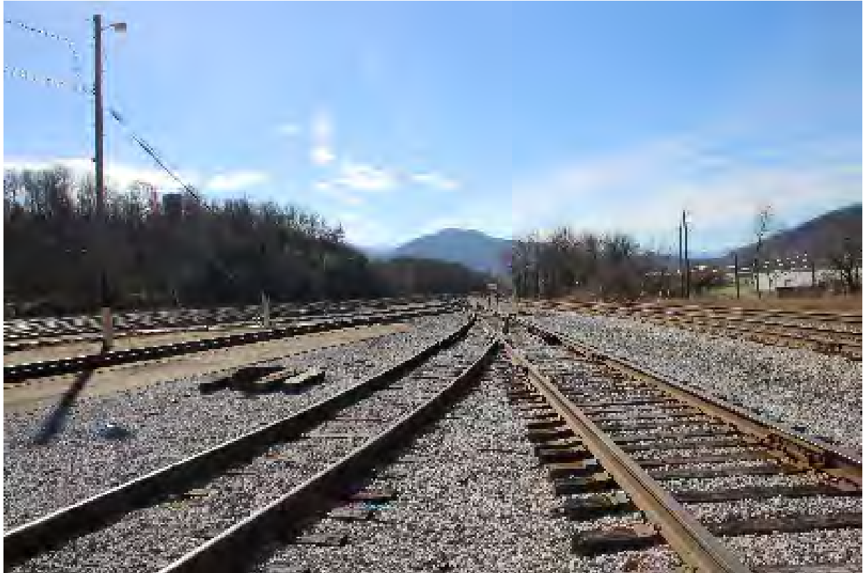
Looking south from the Locomotive Service Center. The yard is empty of cars. The sign seen in the center of the track is blown up below.