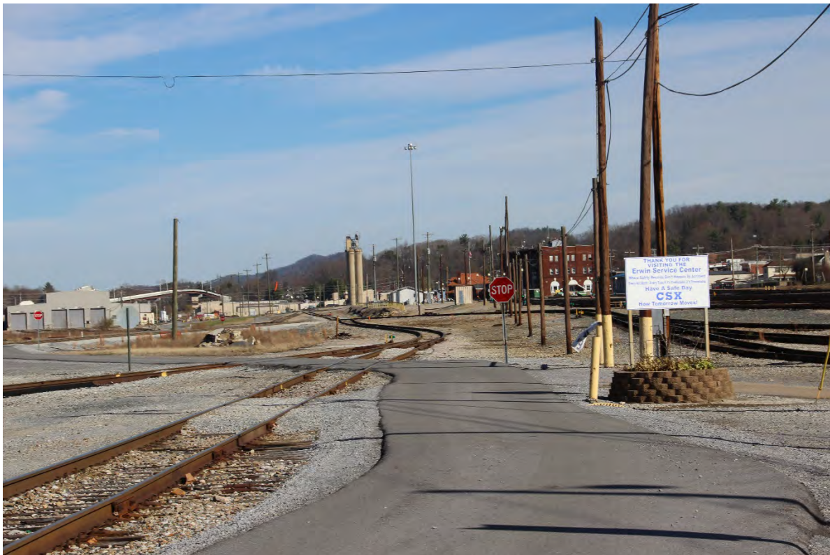
A view north from the north end of the Locomotive Service Center. The Car Repair Shop is on the left and the CSXT Office Building is on the right. The two towers in the center background belong to an off-site company.