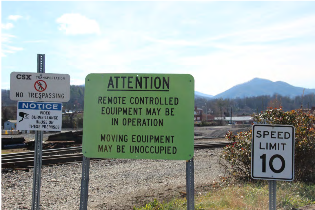
These signs greeted a visitor to Erwin Yard upon rolling past the sign that graces the front page of this journal