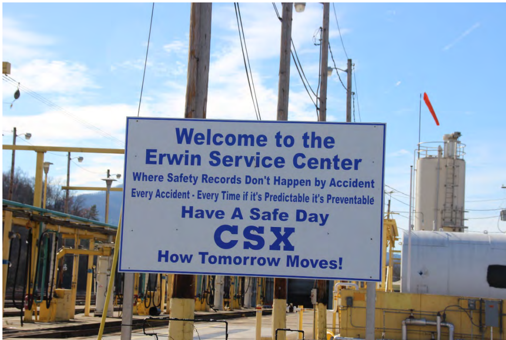
Sign that greets one upon arriving at the Erwin Yard Locomotive Service Facility