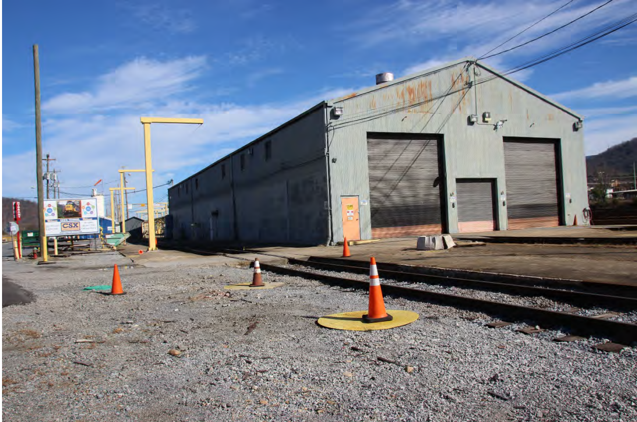
A view looking north of the Locomotive Service Center Building.