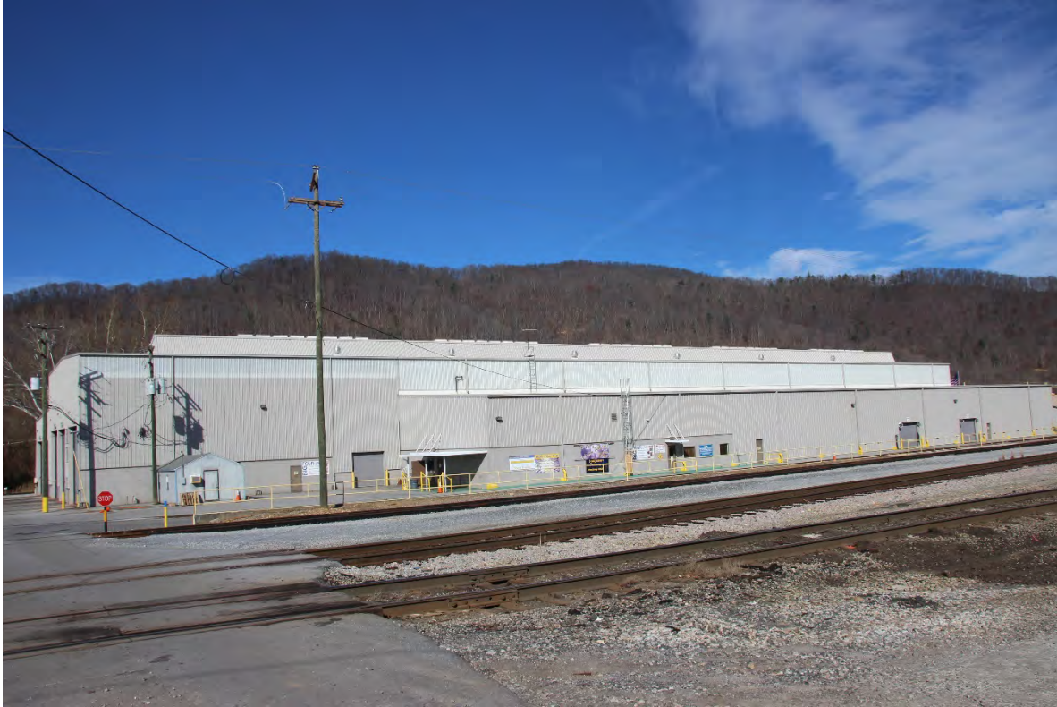
A view of the east side of the Erwin Car Repair Shop