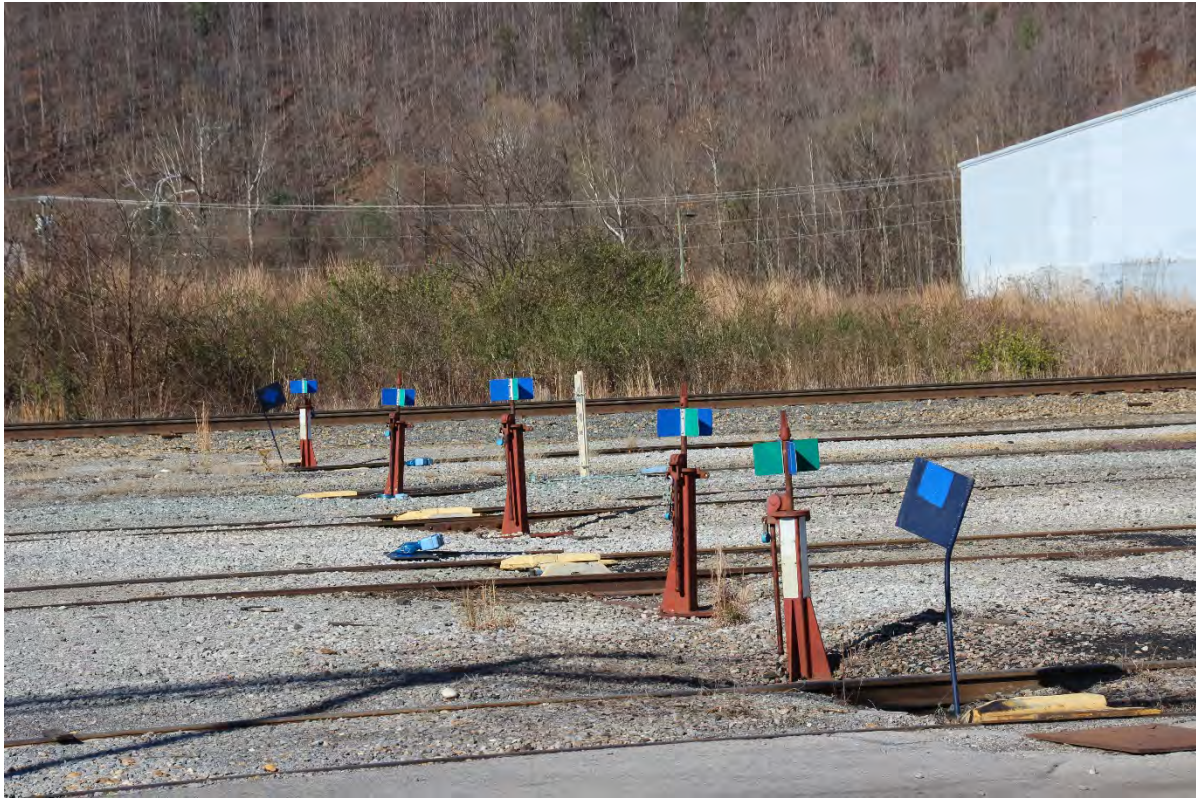
Above and below: Close-up views of the Blue Flag protecting devices at the Car Shop