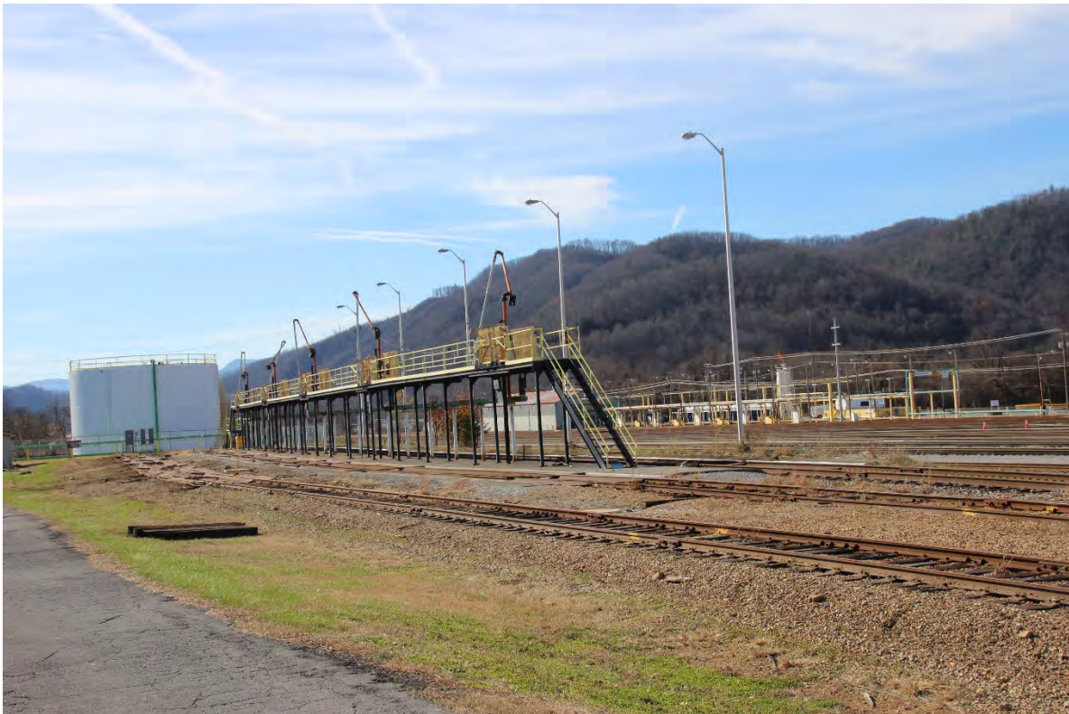
The Erwin Yard fuel storage area. The Locomotive Service Center is seen across the Yard, right center.