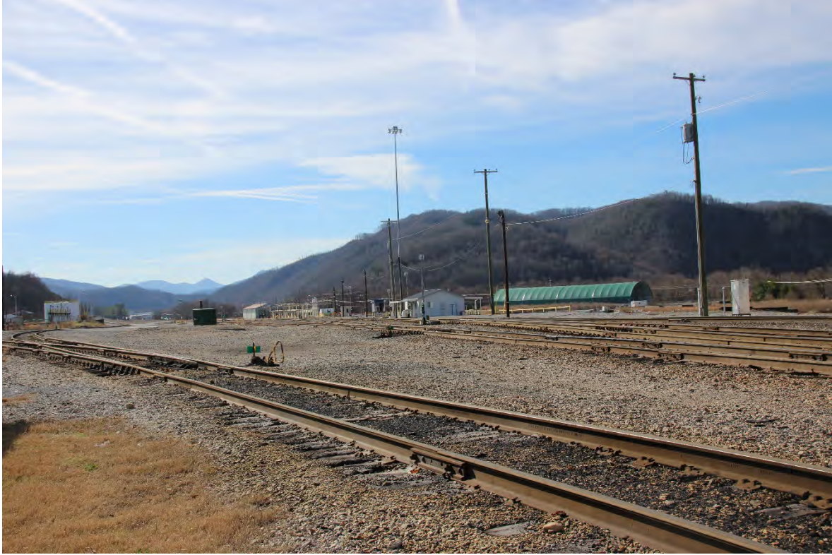
A view south into Erwin Yard from just below the CSXT Office Building