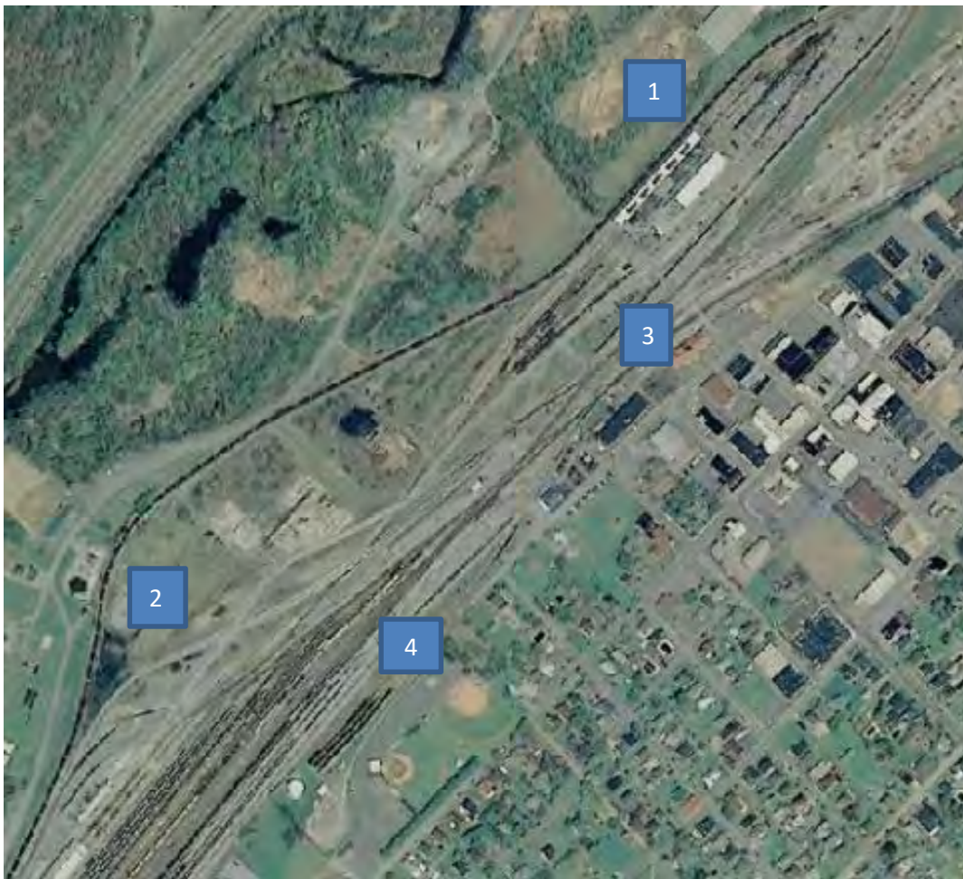
#1 Car Repair Shop, #2 Locomotive Service Center, #3 Former Clinchfield Passenger Depot and CSXT Office Building, #4 Fuel Storage Facility.

The following photos were taken at the Erwin Terminal in November 2015.