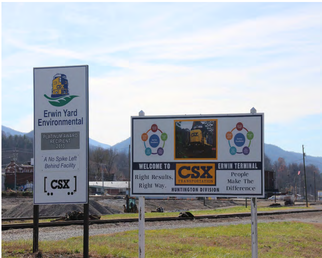
This sign welcoming one to Erwin Yard was encountered as we left the Yard. Hopefully it will once again in the future welcome CSXT employees to work at this facility.