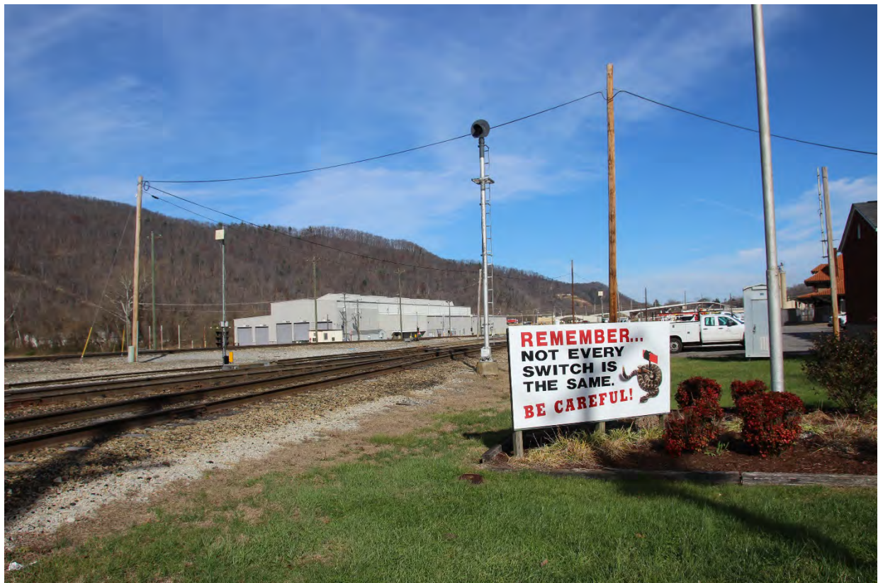
A view into Erwin Yard from in back of the CSXT Office Building