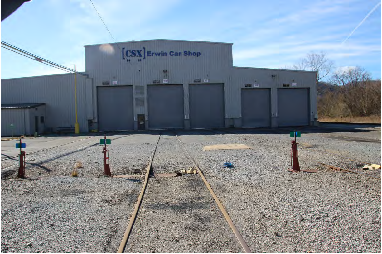
Above and below: A view of the north side of the Car Repair shop. In the upper photo notice Blue Flag protection derails to prevent unauthorized movement of cars within the Car Shop work area.