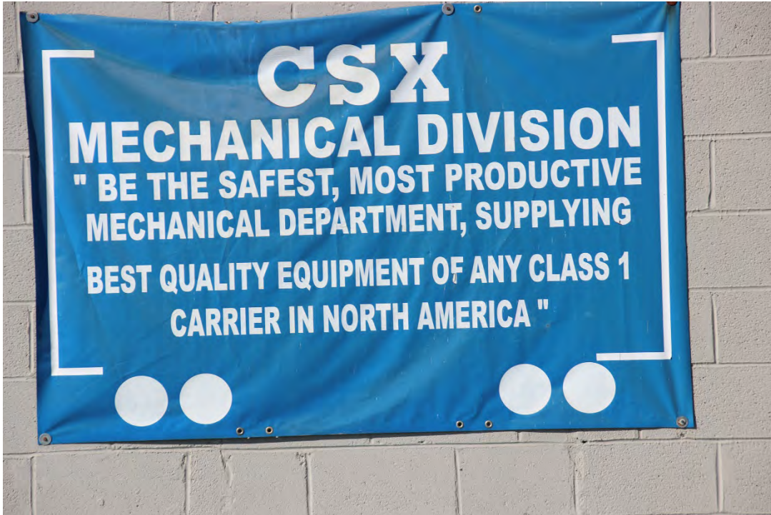
A view of the north end of the Erwin Car Repair Shop