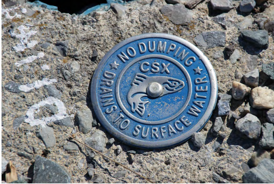
Omnipresent within Erwin Yard were these 12-inch diameter blue metal disks warning not to dump waste water into this drain.