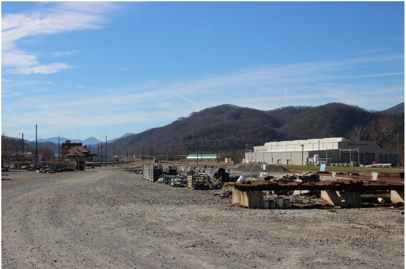
A view into Erwin Yard from the material storage area. The former Clinchfield Passenger Depot is seen in the distance on the left while the Car Repair Shop dominates the right side of the photo.