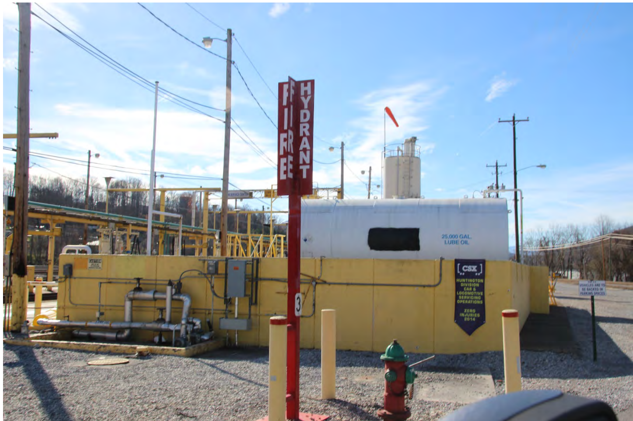
Fuel storage tank at the Locomotive Service Center