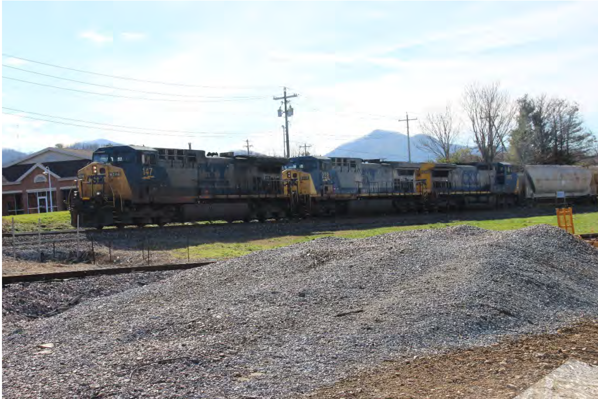
Train Q XXx headed by CSXT147, CSXT 228, and CSXT 7875 rolled through Erwin Yard pulling a 32 car train bound for Johnson City, Tennessee.