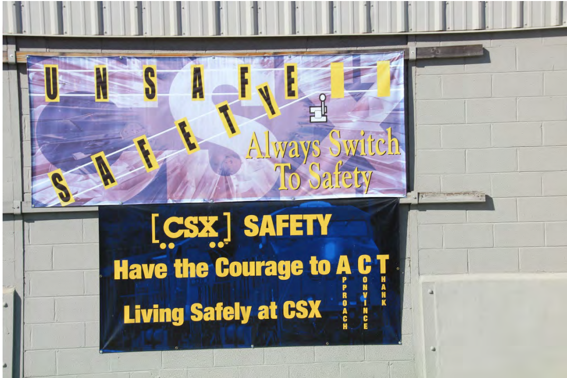
Above and below are some signage found on the outside wall of the Erwin Car Repair Shop.