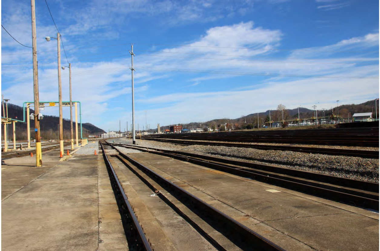
Above and below: Looking north from the Locomotive Service Center