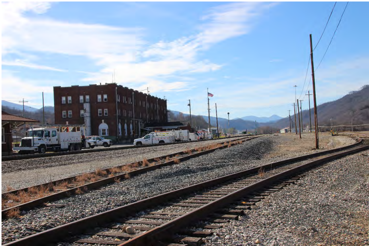
A view south into the Yard past the CSXT Office Building