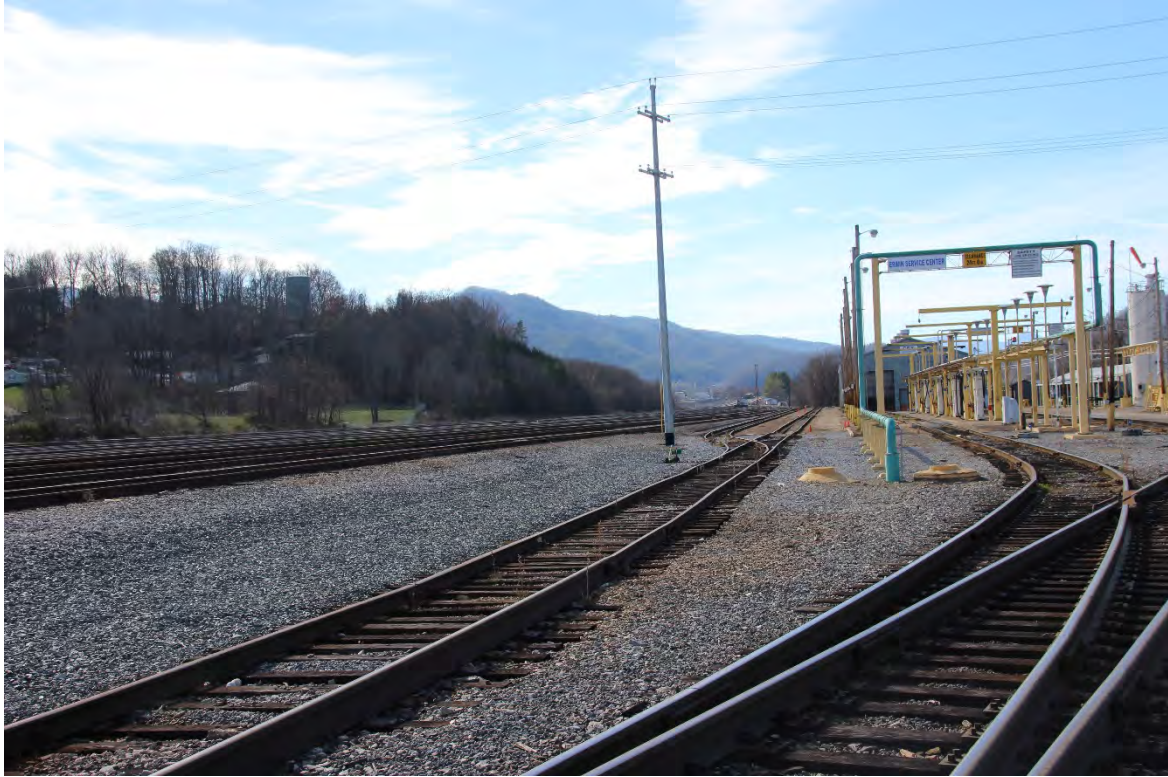
Above and below are views looking south at the Locomotive Service Center.