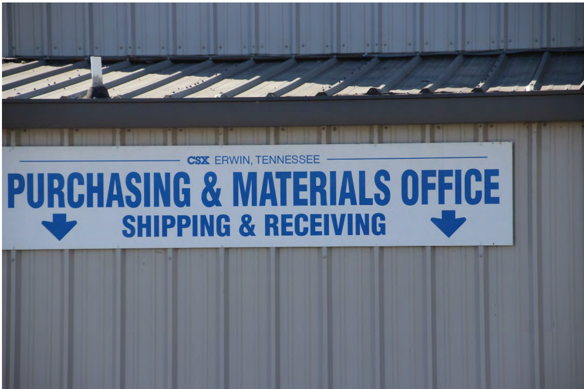
A sign on the side of the Erwin Car Repair Shop