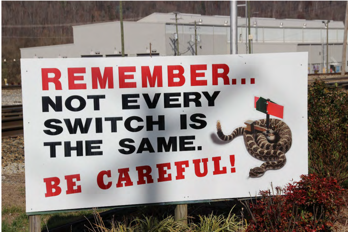
A close-up of the sign in back of the CSXT Office Building