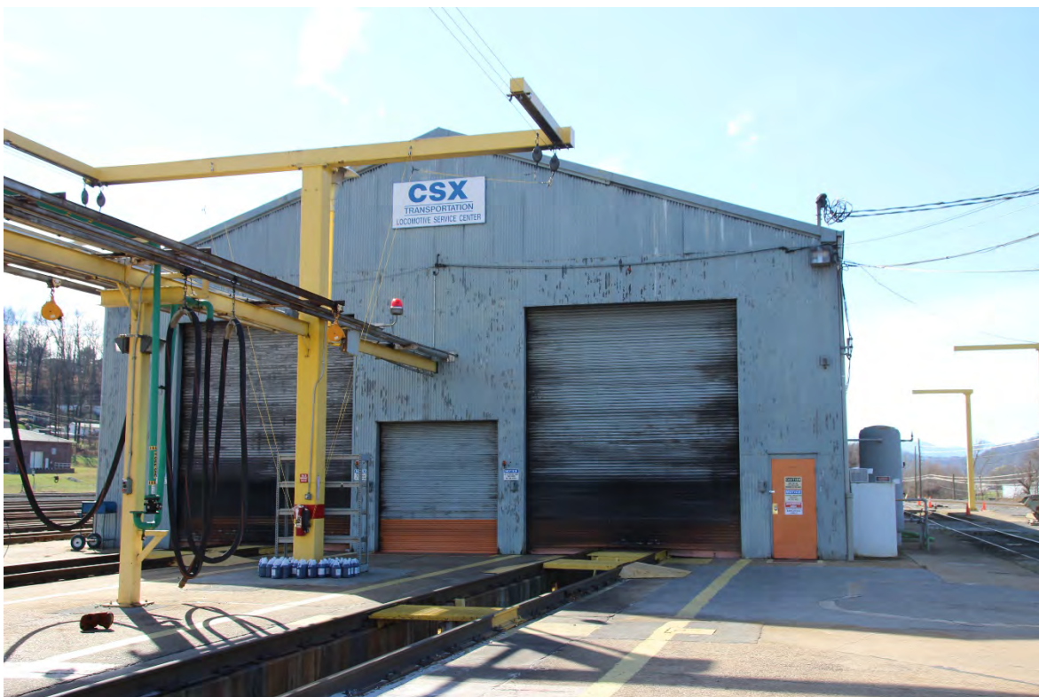
A close-up of the north side of the Locomotive Service Center Building