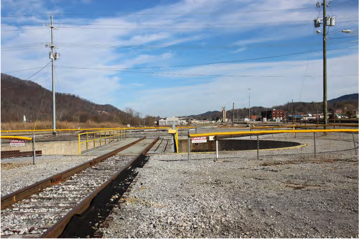
Above and below are views of the Yard's turntable.