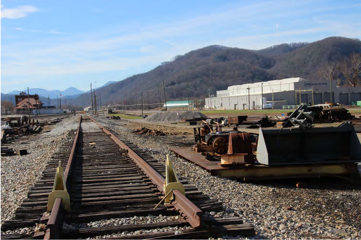
A view from the north end of Erwin Yard. The Maintenance-of-Way equipment normally parked here is gone.