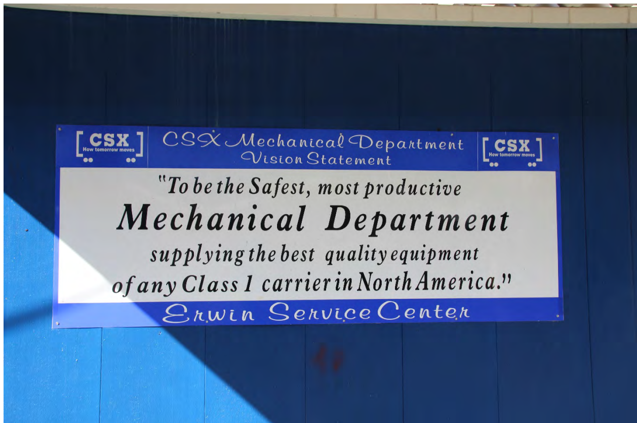
Above and below: Signs found on the Erwin Yard Office Building