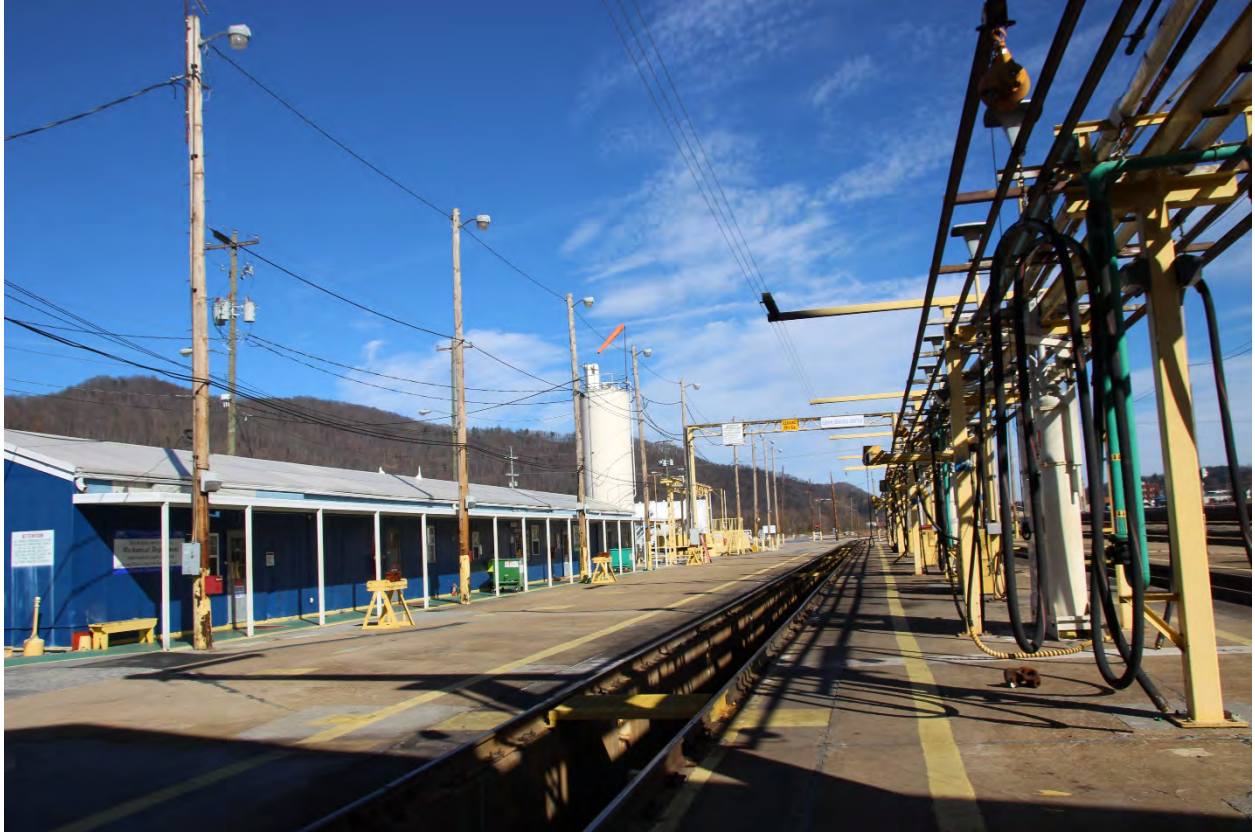
Above and below: Looking north from the Locomotive Service Center with the Yard Office Building on the left