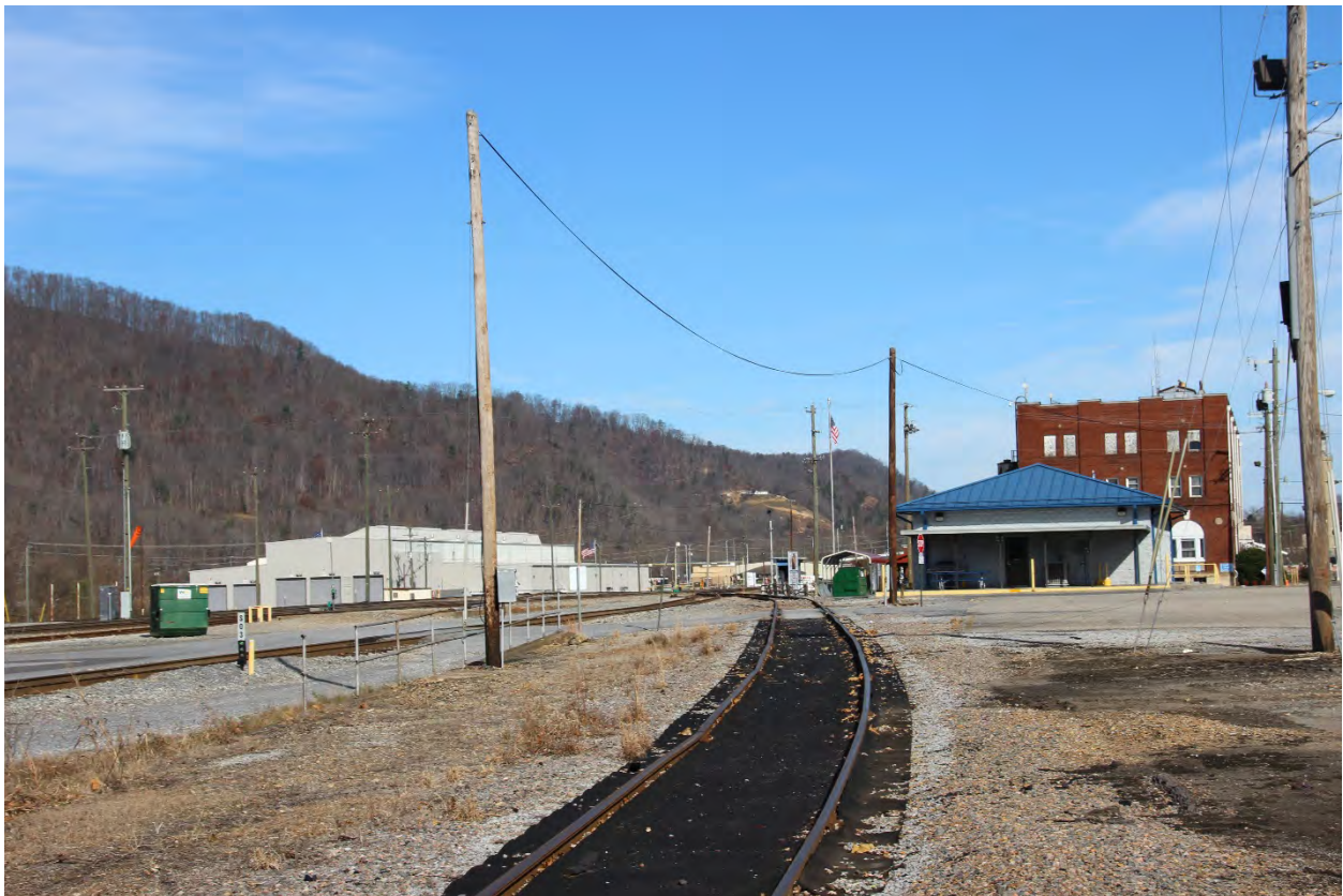
A view north into Erwin Yard midway between the CSXT Office Building and the fuel storage area