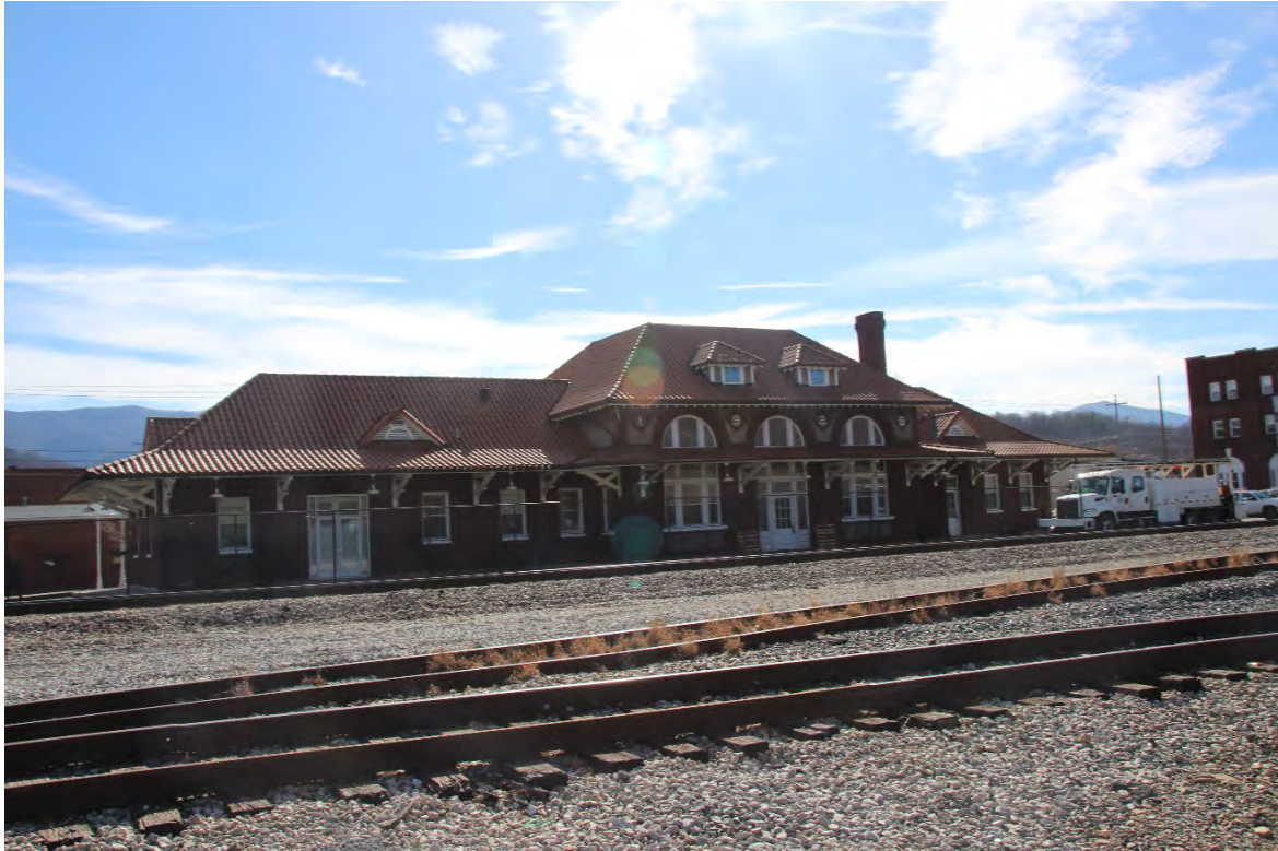
The former Clinchfield Passenger Depot, now the library, as seen from trackside.