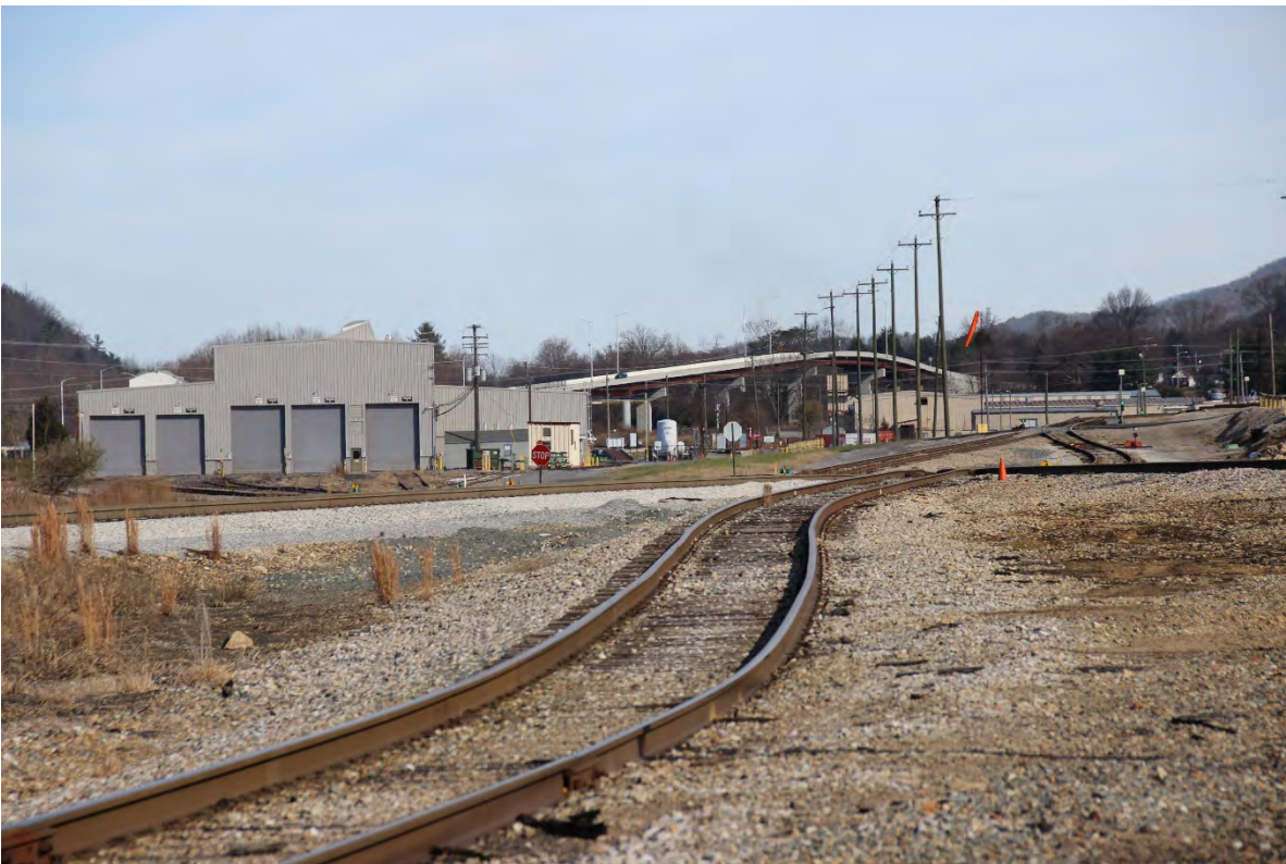
A view of the south end of the Erwin Car Repair Shop