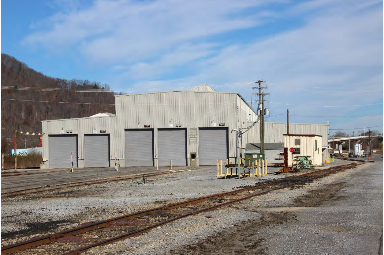
A close-up of the south end of the Erwin Car Repair Shop