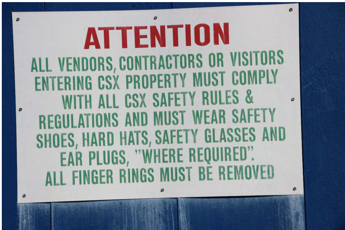
One of the signs posted on the Locomotive Service Center Building.