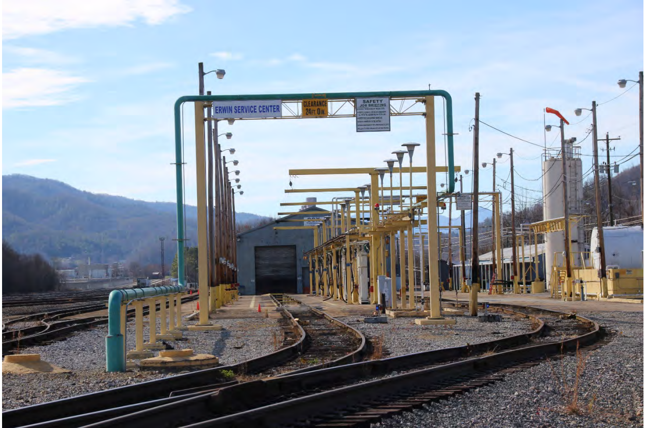
Above and below are two close-up views of the north side of the Locomotive Service Center.