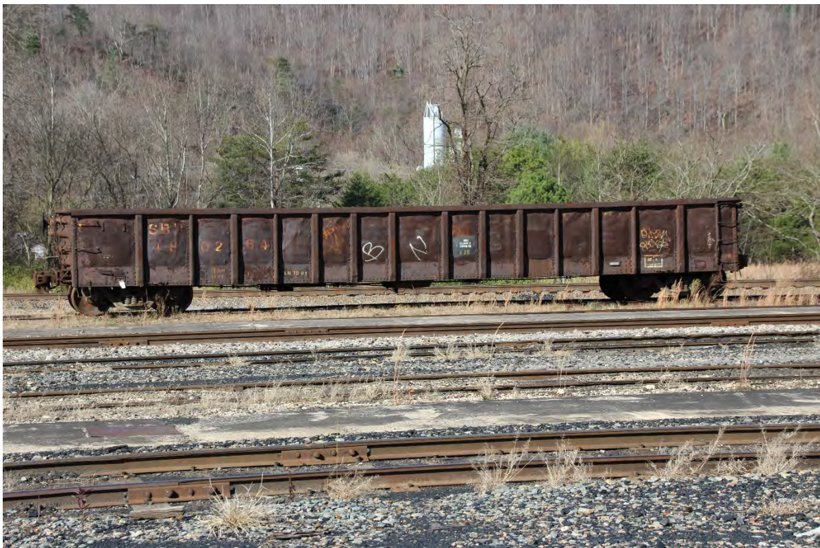
The only car encountered in Erwin Yard was SBD 480264, a bad order gondola car.