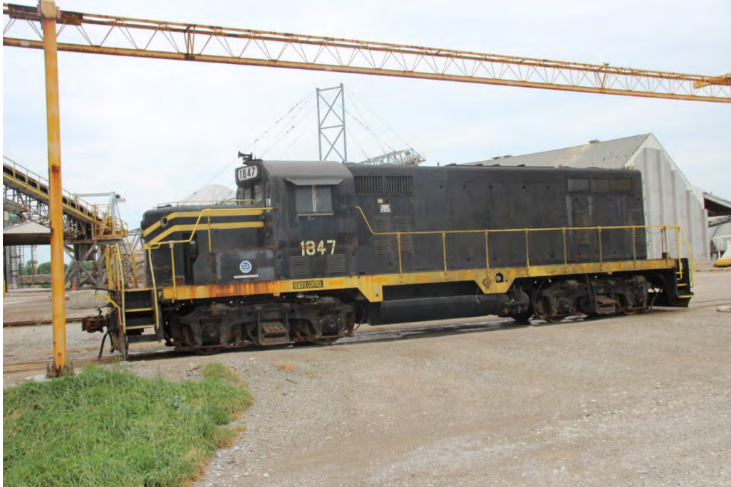
MG 1847, a GM GP20, is used at the Consolidated Grain site for pulling covered hoppers through its grain off-loading shed.