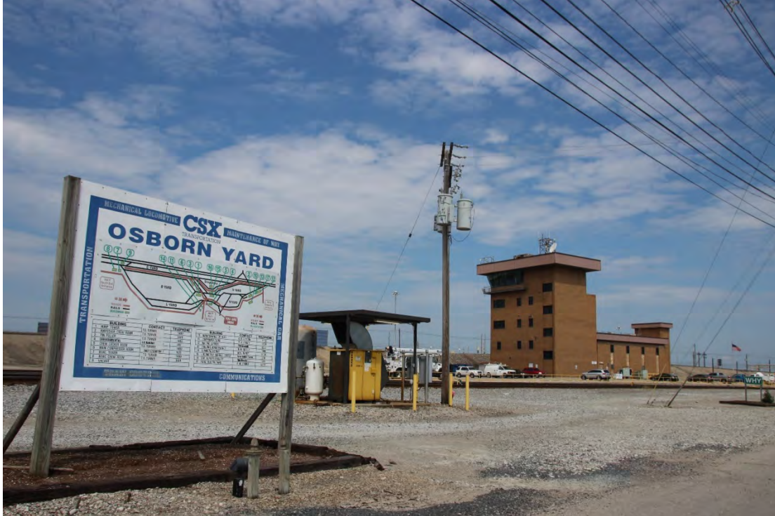
Osborn Yard is the main CSXT Yard in Louisville, Kentucky. To the right is the hump tower and the hump.