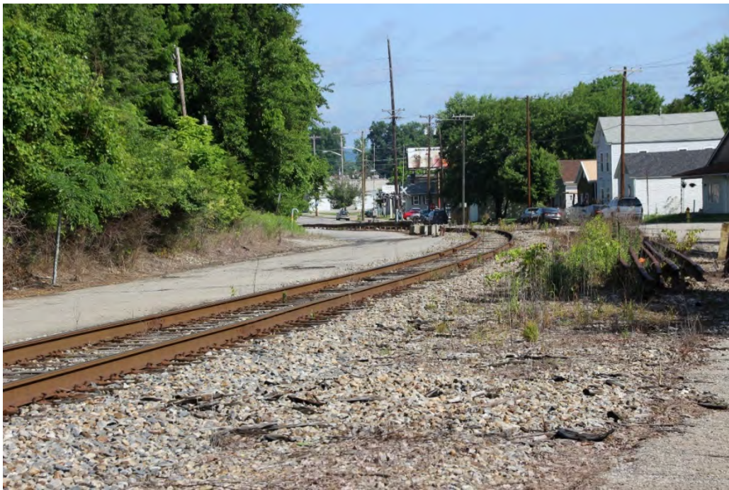
The K&I Bridge is to the rear of the photographer. Chessie B&O track joined this track just beyond the billboard seen above the track. The rails swinging off to the left were used by Monon and Milwaukee to reach K&I's Youngstown Yard.