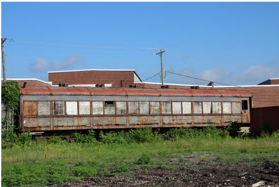
This former Long Island Railroad commuter coach, #304, was found sitting abandoned a mile west of Watson Yard.