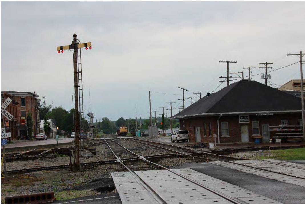
This North Vernon, Indiana, view is looking east along the B&O track. The track in the foreground is the former Pennsylvania track that runs southward to Madison, Indiana. Missing in the photo is the former track of the Big Four which cut diagonally from left to right to join the B&O rail line to Jeffersonville, Indiana, and Louisville, Kentucky