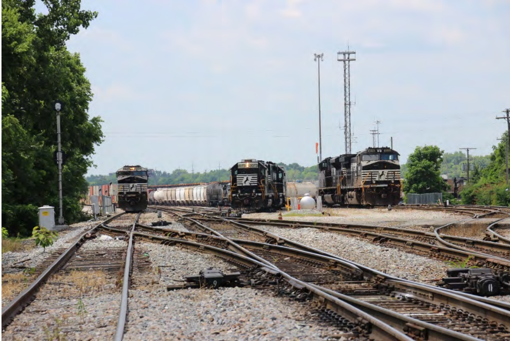
A view south from the above photo into Youngstown Yard. This Yard was used by Chessie until the merger with CSXT.