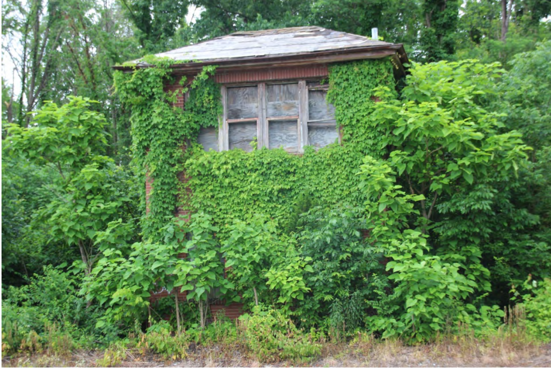
Vegetation is reclaiming Watson Tower which guarded the west end of Watson Yard.