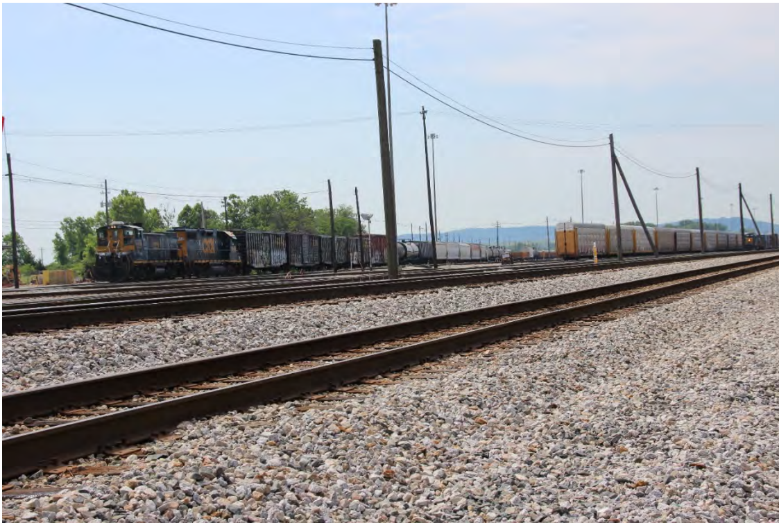
A view south into Osborn Yard from the north end of the Yard. The hump tower is just beyond the tree line seen above the autoracks.