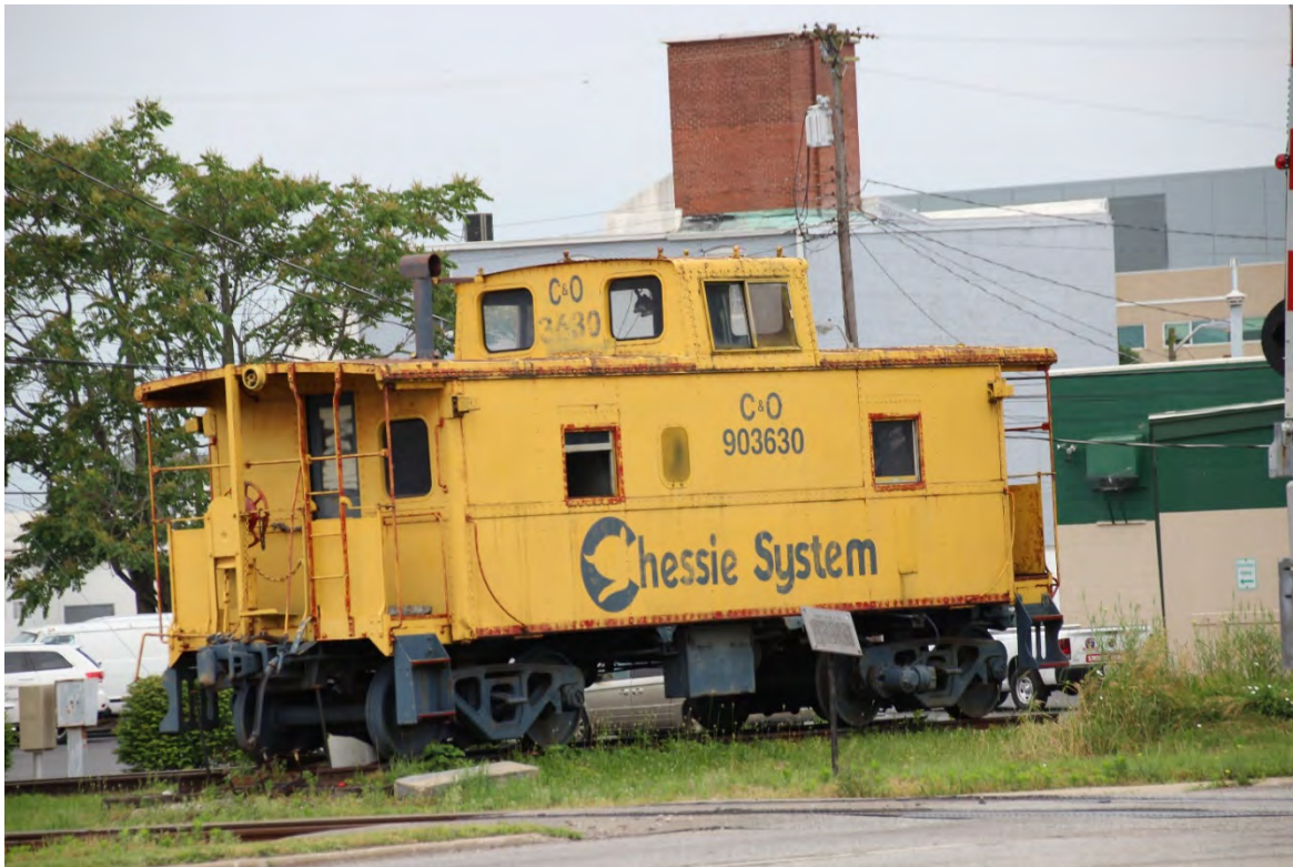
C&O caboose 903630 still in Chessie paint welcomes visitors to downtown Seymour, Indiana. The track in front of the caboose is a lead from the L&I track to CSXT's Cincinnati-St. Louis line.