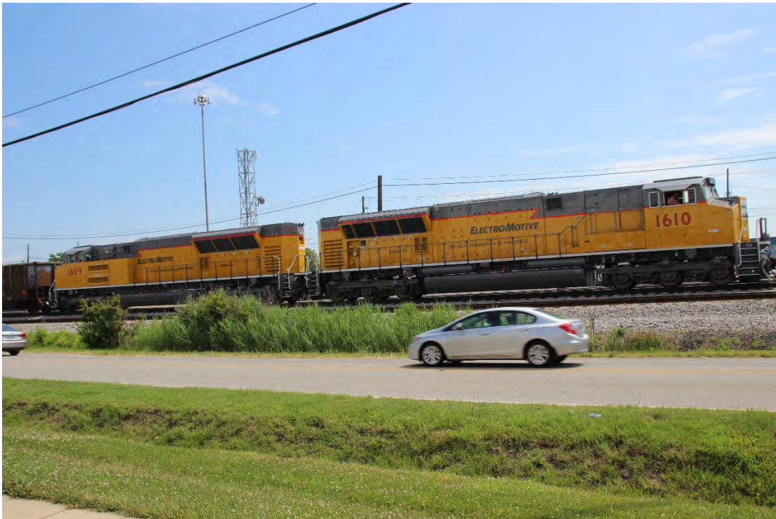
On the way home from the convention, ElectroMotive's test units #1610 and #1609, both SD70ACe-T4, were found southbound on CSXT track in Louisville.