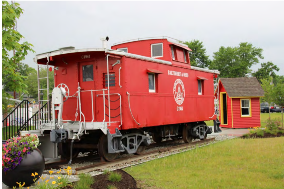
On display in downtown North Vernon, Indiana, next to the CSXT track, is this B&O caboose and watchmen shanty.