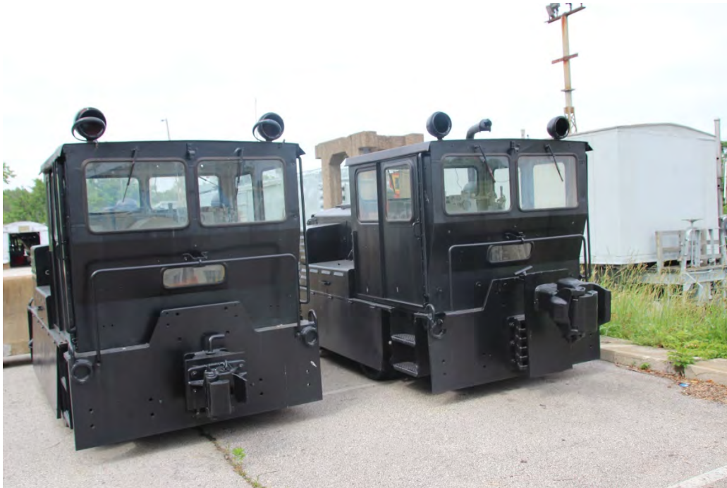
These two Plymouth locomotives were found sitting in a parking lot near Watson Yard. No ownership markings were on them. Notice the different heights of the couplers.