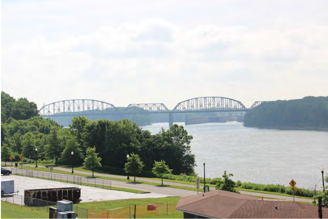
A view of the K&I Bridge from New Albany Riverfront Park. The K&I Bridge was once owned by B&O, Southern, and Monon. CSXT sold its share of the bridge to Norfolk Southern. Under the right span can be seen the lower entrance to the Portland Canal.